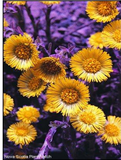
Figure 2. Coltsfoot (Naturewatch 2010)

Approximately 80% of MMF sites are located on private property. Upon issuance of the recovery plan in 1997, many landowners became aware of MMF's presence and its significance (Penskar, pers. comm. 2010). However, changes in ownership since then may not have been updated in the EORs. Because the majority of occurrences are in private ownership, notifying and educating the landowners are the best tools for preventing attrition.