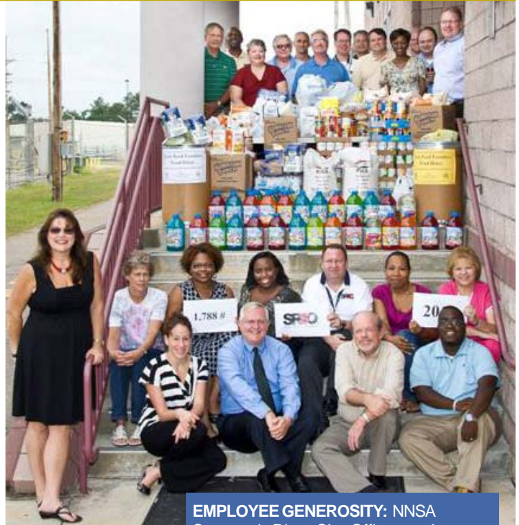
EMPLOYEE GENEROSITY: NNSA Savannah River Site Office employees gather for a group photo at the close of the Feds Feed Families campaign.

This equals approximately two and a half times the set goal. DOE and NNSA collectively succeeded in raising awareness about how hunger has an impact in each community.