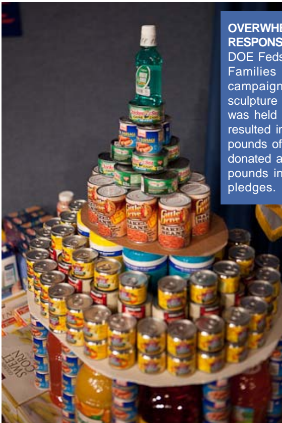
OVERWHELMING RESPONSE: A DOE Feds Feed Families campaign sculpture contest was held and resulted in 2,160 pounds of food donated and 130 pounds in pledges.