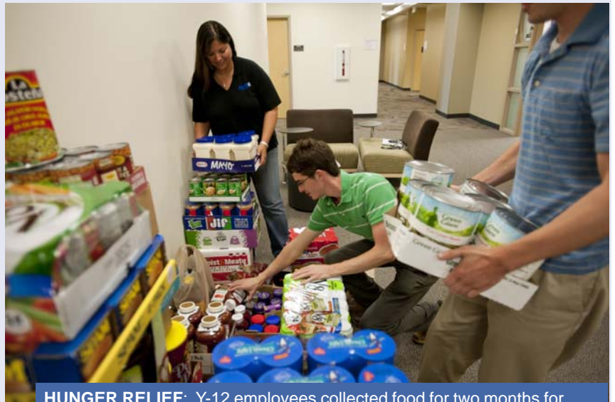
HUNGER RELIEF: Y-12 employees collected food for two months for the annual Feds Feeds Families campaign. Federal employees from Y-12 and Pantex together collected a total of 49,342 pounds of food.

Donations made at the Pantex Plant helped stock the shelves of the High Plains Food Bank. Every month, the food bank helps approximately 68,000 people in the Texas Panhandle, including elderly, handicapped individuals and children. During the