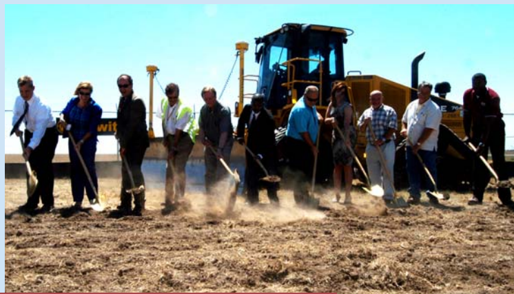
NEW FACILITY GROUNDBREAKING: NNSA and Pantex officials joined local dignitaries to mark the beginning of construction on the new 45,000-square-foot High Explosives Pressing Facility at the Pantex Plant.

site over the years, but to us, it's something much more. This facility represents the future of Pantex. It is