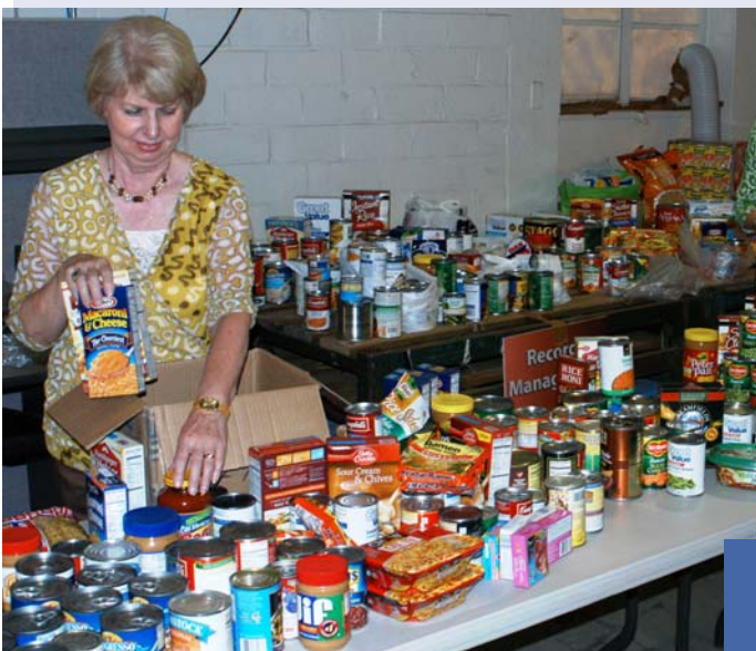
COMMUNITY SUPPORT: Pantex Plant employees donated 25,084 pounds of food to help stock the shelves of the High Plains Food Bank.