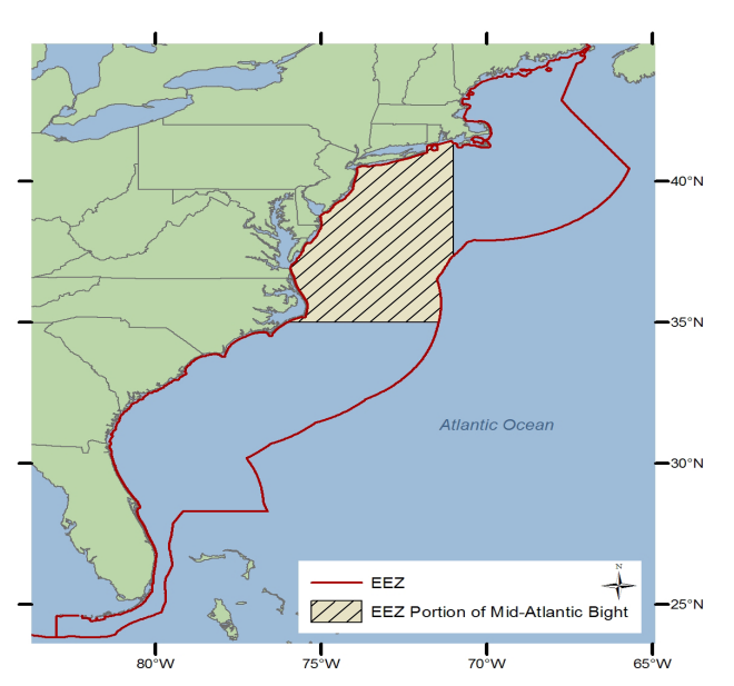
Figure 1: Atlantic Portion of EEZ: State/Federal water boundary seaward to 200 nautical miles.

Pelagic longline sets must not exceed 20 nautical miles (nm) (37.04 km) in mainline length in the EEZ portion of the MAB (Figure 1), including the Cape Hatteras Special Research Area (see Figure 2).