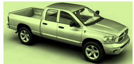
Advanced ICE Vehicle