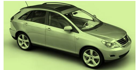
Clean Diesel or CNG Vehicle