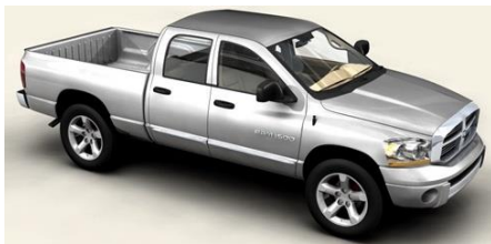
Light Duty Truck