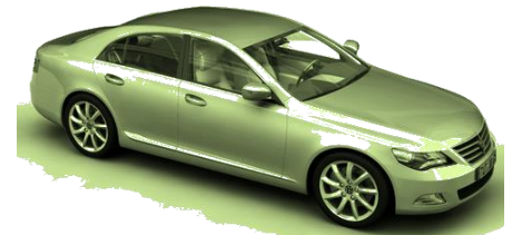
Hybrid or Electric Vehicle