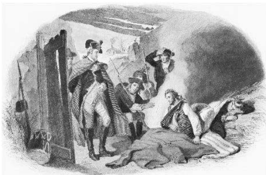
George Washington 1789