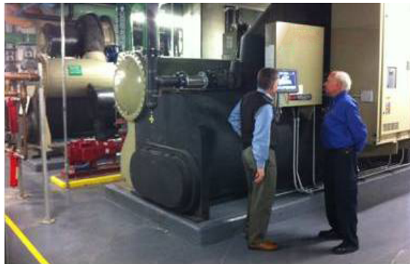
Between 2011 and 2013, Hyatt modernized and optimized its chiller and boiler plants.

Between 2011 and 2013, Hyatt Regency Atlanta improved water and energy efficiency in its chiller and boiler plants, reducing energy use by 10.6 percent. Optimizing a chiller system for energy efficiency reduces the heating load on the cooling tower, which means that less water needs to be evaporated to dissipate the reduced heat load. Likewise, energy efficiency in the boiler system results in water efficiency. Optimizing these two systems allowed Hyatt Regency Atlanta to reduce water and energy use, contributing to its overall 36 million gallons of water savings in 2013 alone.