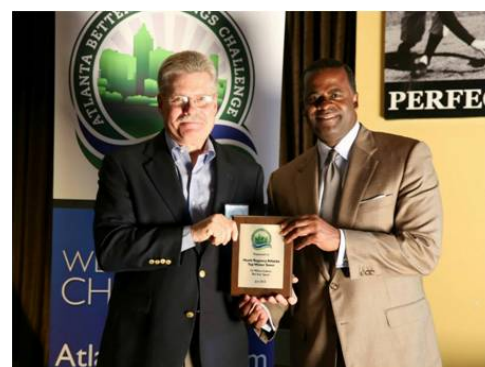
Hyatt Regency Atlanta received the Atlanta Better Buildings Challenge “Top Water Saver” award.