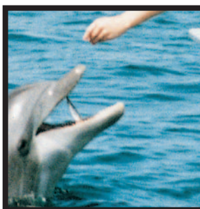
Dolphins can bite the hands that feed them!

and people have been pulled under the water.