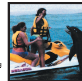
Too close! Don't closely approach, chase or tease wild dolphins—It's dangerous for them and for you!

him. However, truly wild dolphins will bite when they are angry, frustrated, or afraid. When people try to swim with wild dolphins, the dolphins are disturbed. Dolphins who have become career moochers can get pushy, aggressive and threatening when they don't get the hand-out they expect.