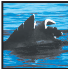
This dolphin was hit by a boat and its dorsal fin was severely injured.

feeding wild dolphin disrupts their social groups which threatens their ability to survive in the wild. Young dolphins do not survive if their mothers