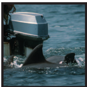
Danger! These dolphins are at risk of being cut by propellers!

and can be severely injured. They learn to associate people with food and get entangled with fishing hooks and lines and die. They get sick from