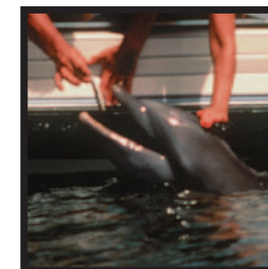
Danger! This dolphin is being taught to depend on people for handouts.

the Flipper myth of a friendly wild dolphin has given us the wrong idea. Flipper was actually a trained, captive dolphin who did not bite the hand that fed