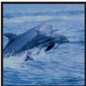
Dolphins need their space, especially mothers with young.

but when people offer them food, dolphins, like most animals, take the easy way out. They learn to beg for a living, lose their fear of humans, and do