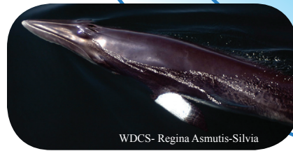
WDCS- Regina Asmutis-Silvia