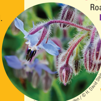
Borage in the Herb Garden