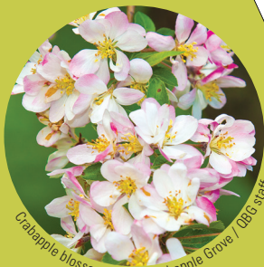
Crabapple blossoms in the Crabapple Grove / QBG staff

Queens Botanical Garden is a living museum, a place of peace and beauty for the quiet enjoyment of our visitors. Please respect all living things within our gates—plants, birds, insects, wildlife, and people.