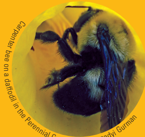
Carliner bee on a thistle in the Perennial Garden