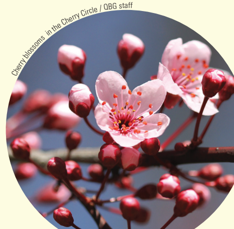
Cherry blossoms in the Cherry Circle