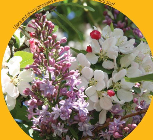
Lilacs and cherry blossoms in the Fragrance Walk