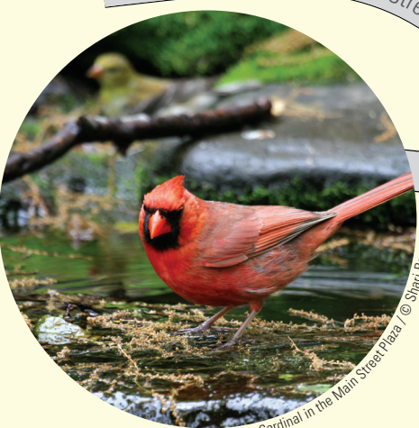
Cardinal in the Main Street Plaza