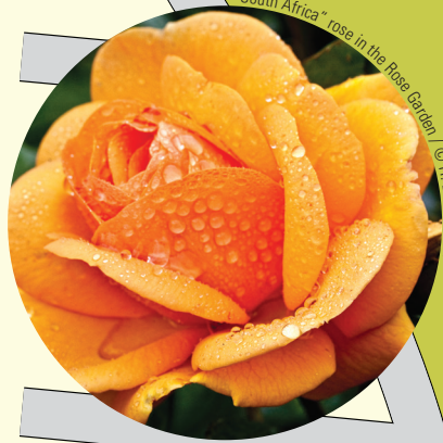
"South Africa" rose in the Rose Garden