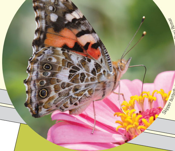
Slipper butterfly in the Annual Garden