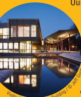
Visitor & Administration Building

QBG is a critical part of a green corridor, providing home and shelter for many species of native wildlife . Look closely and you'll catch sight of our resident birds and a world of butterflies, bees, beetles, and other insects that pollinate our Garden and help it to thrive.