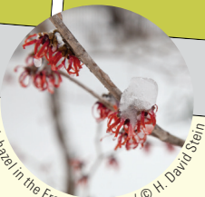
Winter hazel in the Fragrance Walk