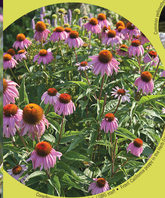
Coneflowers in the Herb Garden / QBG staff

Queens Botanical Garden is an urban oasis where people, plants and cultures are celebrated through inspiring gardens, innovative educational programs and demonstrations of environmental stewardship.