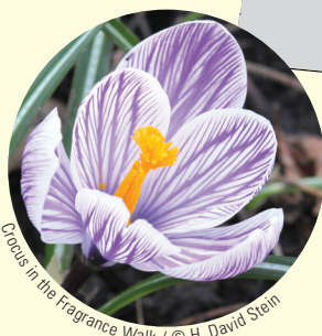
Crocus in the Fragrance Walk