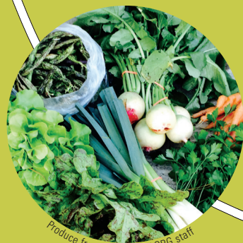
Produce from QBG Farm / QBG staff