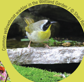
Common yellowthroat warbler in the Wetland Garden