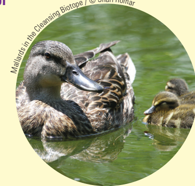
Mallards in the Cleansing Biotope

Watch for birds! Many birds make Queens Botanical Garden their home. Look for ducks in our Biotope (#19). Throughout our gardens you might also spot blue jays, robins, cardinals, mourning doves, woodpeckers, pheasants, hawks, and more!