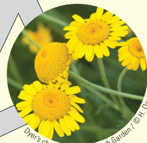
Dyer's chamomile in the Herb Garden