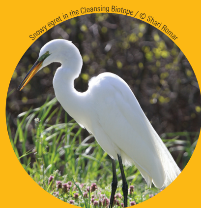
Snowy egret in the Cleansing Biotope