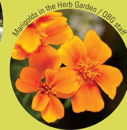
Marigolds in the Herb Garden