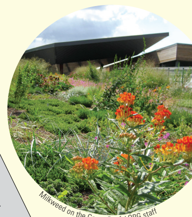
Milkweed on the Green Roof / QBG staff