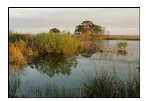
Wetland habitat

HGM analyses help to insure that such restorations will be successful by matching restoration strategies with the historical conditions of the targeted ecosystems.