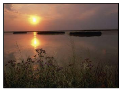
Benton Lake NWR, Credit: USFWS

Hydrogeomorphic (HGM) analysis is a three-step process used to evaluate riparian and wetland ecosystems and surrounding landscapes. It is used to identify options for restoring areas to their original functions, before humaninduced alterations, all within the context of landscape-scale conservation and species preservation.