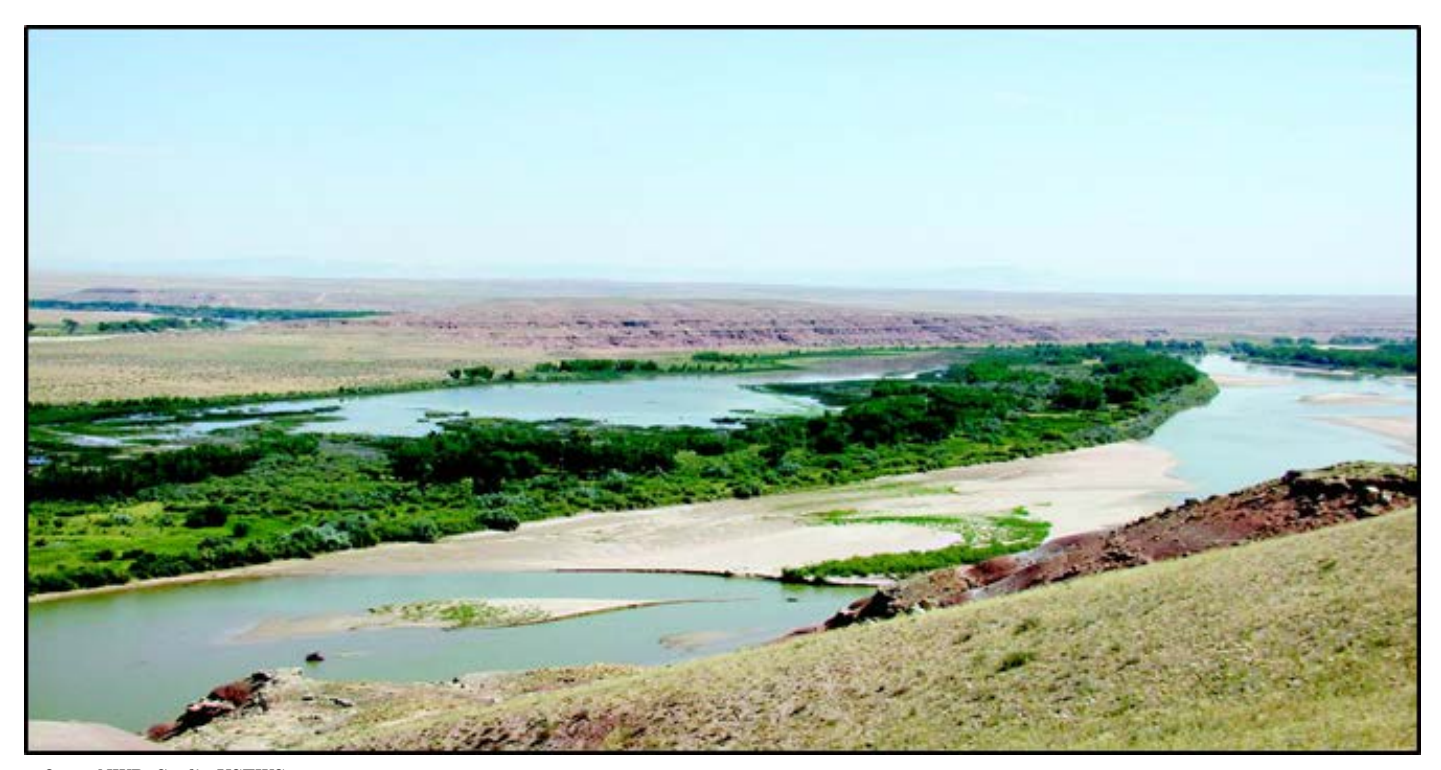
Ouray NWR

The third step is to identify strategies for restoring an area to the historical condition within the context of the larger landscape.