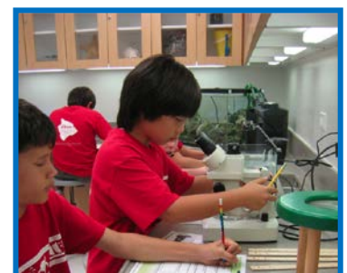
Wetlab at the Mokupāpapa Discovery Center.