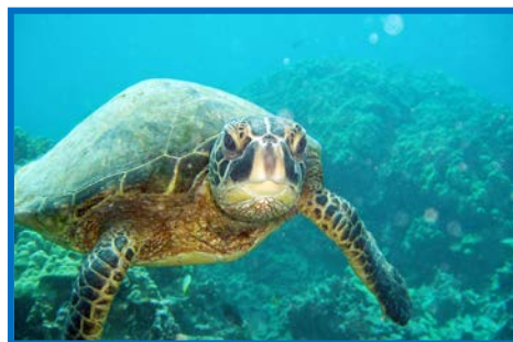
Conservation and sustainability are community priorities for a Sanctuary Discovery Center.