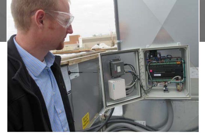
VOLTTRON™ capabilities, installed in building systems, can help the grid manage the challenges posed by wind and solar energy.

To download VOLTTRON™, visit https://github.com/VOLTTRON/volttron