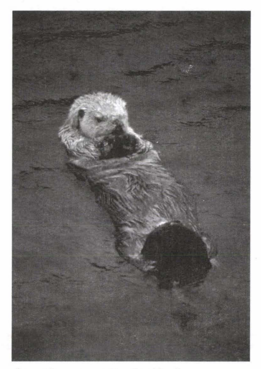
A northern sea otter in Alaska.

The Service actively participates in a joint task force in San Francisco, including representatives from the U.S. Customs Service, the Department of Agriculture, and the Food and Drug Administration, to address the importation of animal parts and products for the Asian community. The task force investigates violations of statutes and regulations relating to the importation of material often used as medicinals, and implements an out-reach program designed to inform importers about the law. The U.S. Attorney's office for the