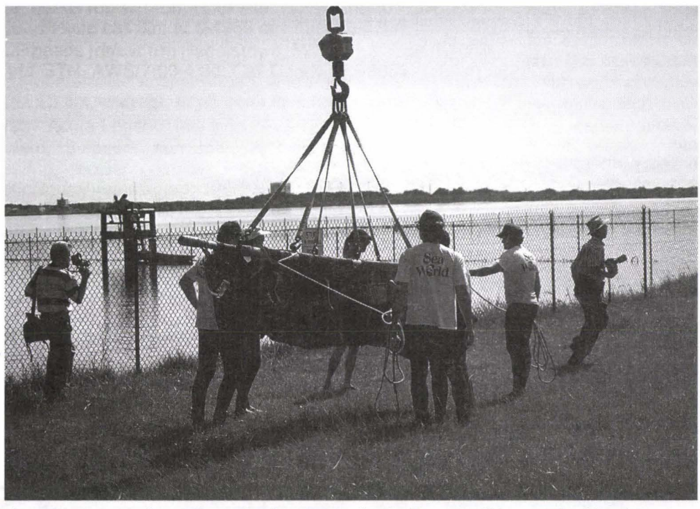
A manatee transfer at the soft release pens in the Banana River at the Merritt Island National Wildlife Refuge, Florida.

Manatee behavior and habitat have been closely monitored for more than 20 years through the carcass salvage program, BRD/GS's photo-identification system, aerial surveys, tracking projects, and other studies. These studies have provided a wealth of information, most of which has been made available to managers through a variety of media, including Geographic Information Systems (GIS). These data are used to develop population models and to assist