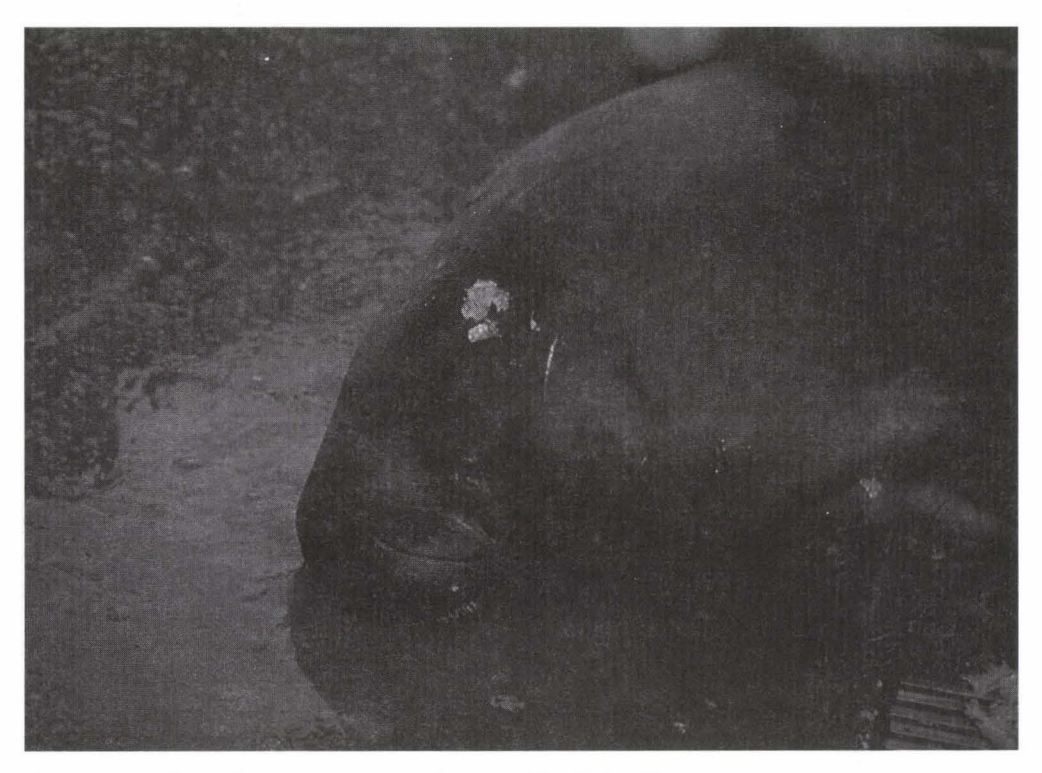
Chessie awaiting his release from Sea World of Florida.

Satisfactory drugging protocols have been developed for safely immobilizing walrus for attachment of radio transmitters to tusks.