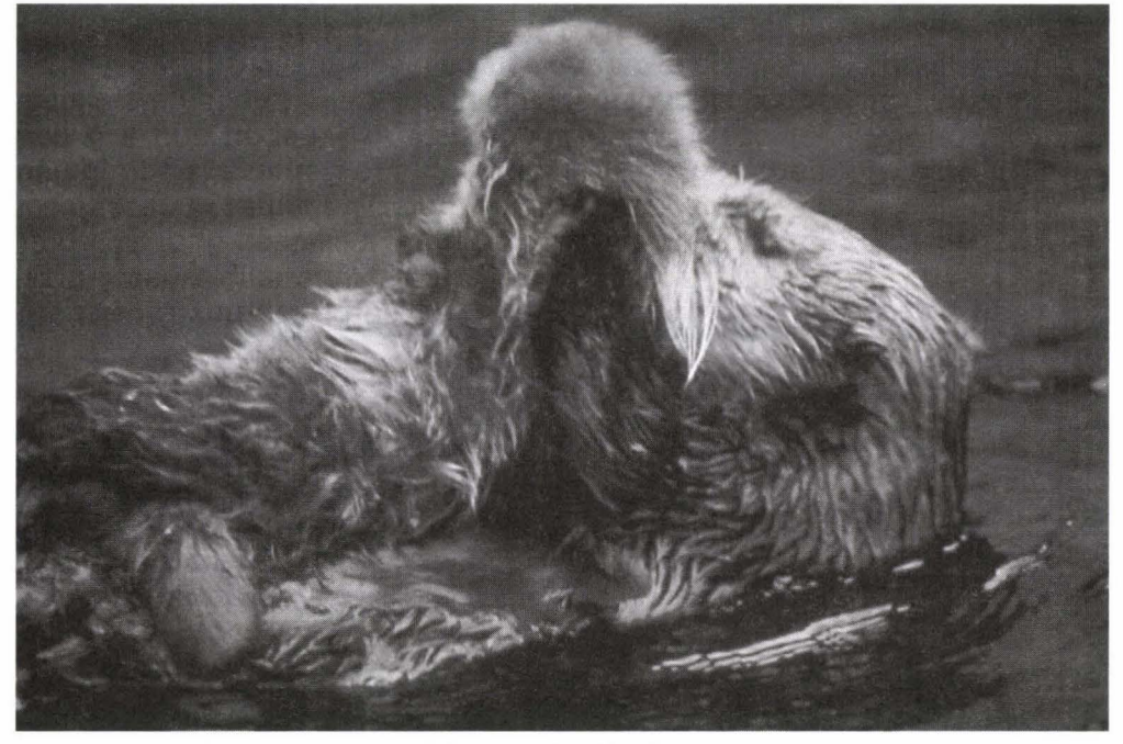
A female northern sea otter with her pup in Alaska.

The goal of this project is to document the status of the polar basin ecosystem by quantifying the relationship between polar bears (the apical predator) and ringed seals (the principal prey of polar bears). Most aspects of polar bear foraging ecology are poorly understood. Preference of polar bears for various ice habitat types will be determined by retrospective analysis of satellite ice images and satellite relocations of polar bears. Snow-tracking of polar bears will be combined with surveys of ringed seal