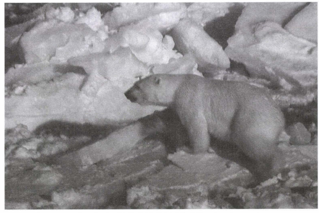
A polar bear on ice in Alaska.

The MMS's Gulf of Alaska/Yakutat Planning Area Oil and Gas Lease Sale 158 DEIS was produced in December 1995. The Service offered a Biological Opinion in October 1995 on this proposed sale. No marine mammals were found to be involved with this proposed lease.