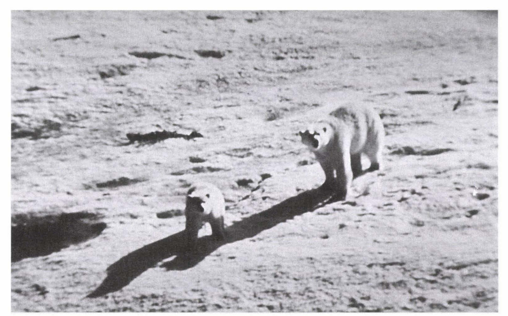
A female polar bear with cub in Alaska.

With regard to implementing the 1994 provisions of the Act that allow for the issuance of permits to import personal, sport-hunted polar bear trophies taken in Canada, the Service issued proposed