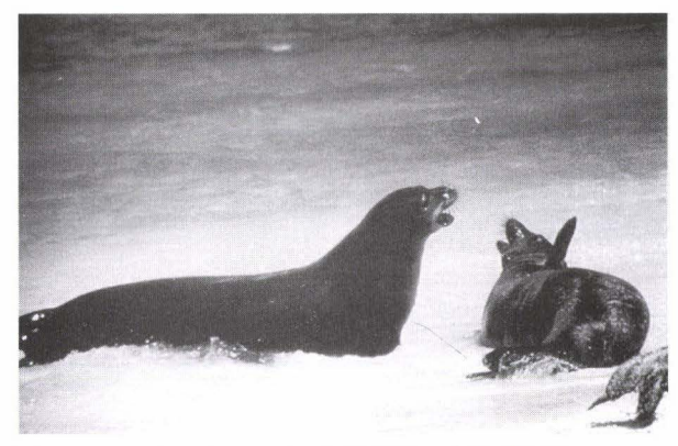
Hawaiian monk seals sparring.