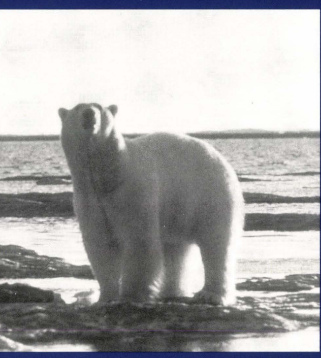
U.S. Department of the Interior • U.S. Fish and Wildlife Service Washington, DC 20240