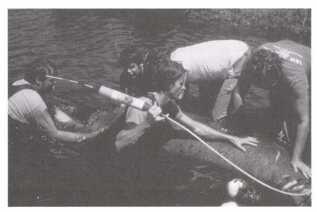
A West Indian manatee, with transmitter attached, about to be released.

Since 1991, state-wide synoptic aerial surveys of manatee wintering habitat in southeast Georgia