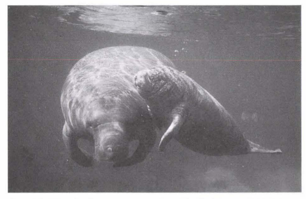
An adult West Indian manatee and calf.

The Service administers requests for waiving the moratorium and for the transfer of management authority to States, issues permits, conducts research programs, enforces provisions of the Act, publishes rules and regulations to manage marine mammals, cooperates with the States, and participates in international activities and agreements. In addition, the Service lists and delists species as endangered or threatened and undertakes other Endangered Species Act-related responsibilities and maintains a