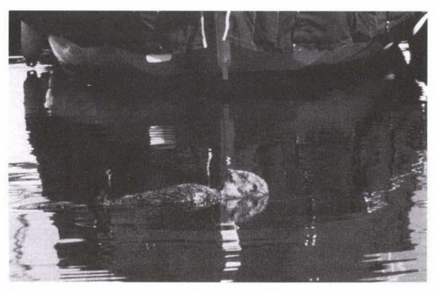
A southern sea otter.

Public Law 99-625 provides authority and establishes guidelines for carrying out the translocation program. A Final Environmental Impact Statement and rulemaking were distributed by the Service in May 1987. The final rule establishes the boundaries of a Translocation Zone to which otters would be translocated and given protection similar to that of the parent population, and a Management Zone to be maintained otter-free by non-lethal means. The Translocation Zone consists of San Nicolas Island and surrounding waters in the Southern California Bight, ranging from 10-19 nautical miles from the 15-fathom contour surrounding San Nicolas Island. The Management Zone must surround the Translocation Zone separating it from the parent