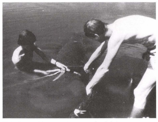
Biologists attaching transmitter to a peduncle belt on a West Indian manatee.

Service Wildlife Inspectors increased their inspection efforts throughout the Pacific Region in 1992 to detect the illegal importation of marine mammals