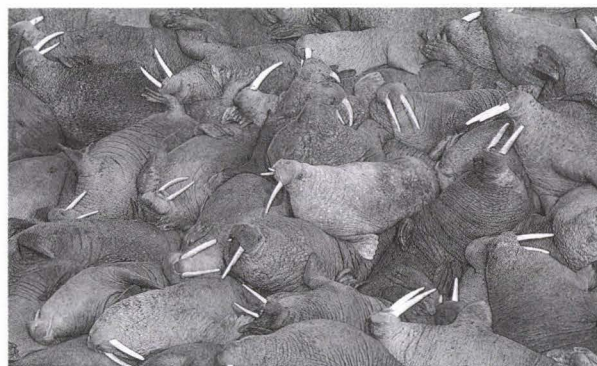
A white, three tusked walrus (lower center).

The Service administers requests for waiving the moratorium and for the transfer of management authority to States, issues permits, conducts research programs, enforces provisions of the Act, publishes rules and regulations to manage marine mammals, cooperates with the States, and participates in international activities and agreements. In addition, the Service lists and delists species as endangered or threatened and undertakes other Endangered