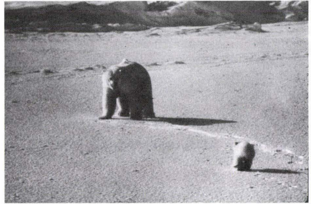
A polar bear sow waits for her cub.

The 3rd Joint US-USSR Sea Otter Symposium was held from September 9-15, 1991, in Petropavlovsk, Kamchatka. The six-member United States delegation included staff from the Service's Office of Research, and Western and Alaska Regions; a staff member from the Monterey Bay Aquarium, California, was also part of the delegation. Papers on a variety of topics were presented including the status of sea otter populations in California, Alaska and Russia, as well as results from various research projects. The recent die-off of sea otters at Medny Islands, Russia, was discussed at length. Tentative plans were made for future exchanges. The 4th Joint US-USSR Sea Otter Symposium is scheduled to be held in Alaska in 1993.