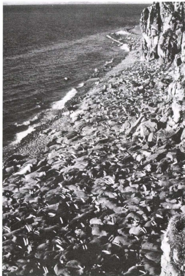
Walrus massed on a Bristol Bay haulout.

Analysis of data collected during the two year closure indicated the closure was having positive effects on walrus utilization of these haulout sites and that an extension of the closure was warranted. Therefore, the Service recommended at the August 1991 NPFMC meeting that the NMFS continue the 12 nautical mile closure indefinitely. The NMFS decision was expected in early 1992.