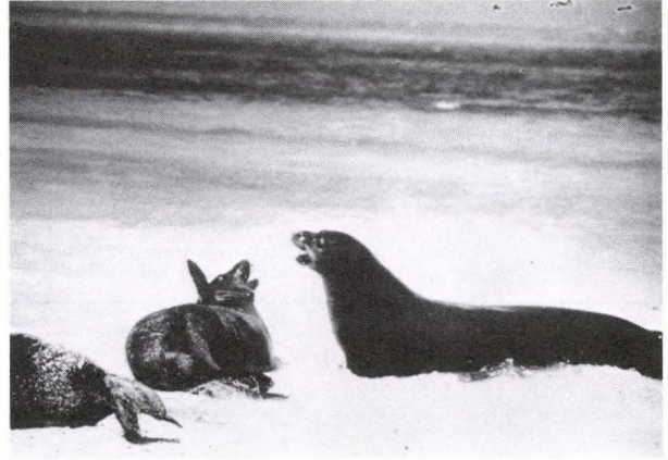
Hawaiian monk seals.

Monk seal censuses conducted by refuge staff at Tern Island detected increases in the number of injured seals and the amount of discarded fishing gear. This finding, along with observations of monk seals with embedded fishing hooks, led to an emergency closure of the longline fishery in the waters surrounding the Northwestern Hawaiian Islands (NWHI). Service Refuge and Fish and Wildlife Enhancement personnel were substantially involved in the enactment of a permanent closure of the longline fishery, for waters within 50 miles of the NWHI.