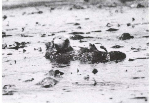
A sea otter floating in kelp. U.S. Fish and Wildlife Service photo.

The California Department of Fish and Game (CDFG) and the Service again conducted a spring and fall survey in 1991. The area surveyed included the entire 220-mile long established range of the southern sea otter population, from Point Ano Nuevo in Santa Cruz County to the Santa Maria River in San Luis Obispo County, plus additional peripheral habitat. The total numbers of otters counted during the spring 1991 survey was higher than any since these counts were first begun [Table 12]. As a rule, fall counts are consistently lower than spring counts. This may, in part, be due to the fact that sea otters are more difficult to observe in the