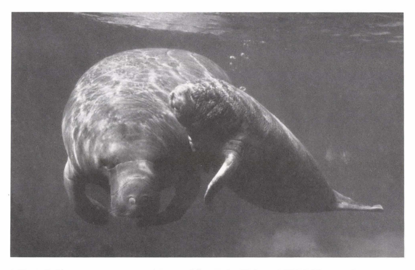
A West Indian manatee cow and her calf.