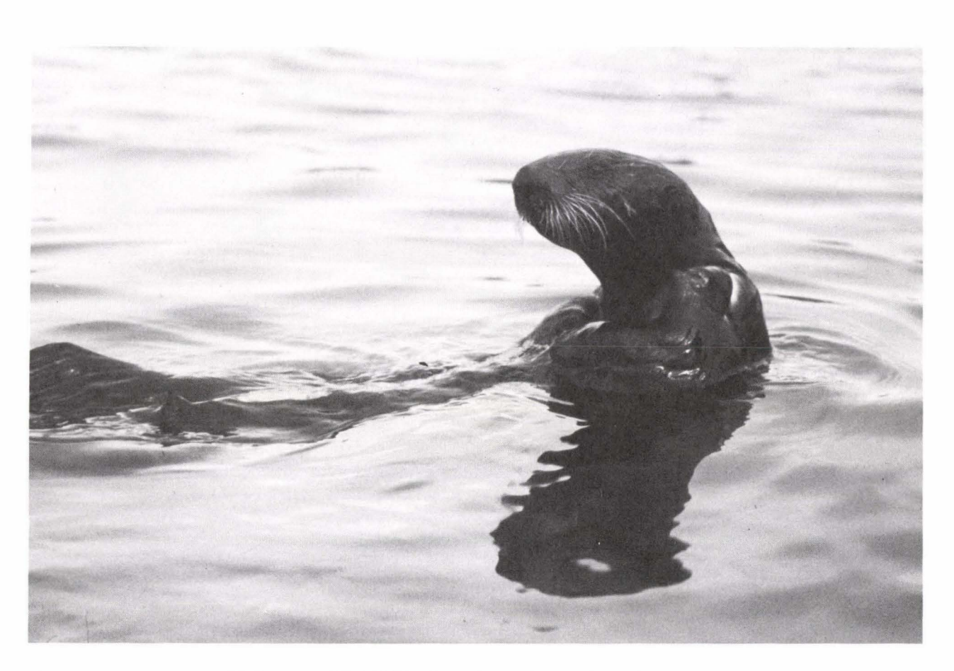
Sea otter.