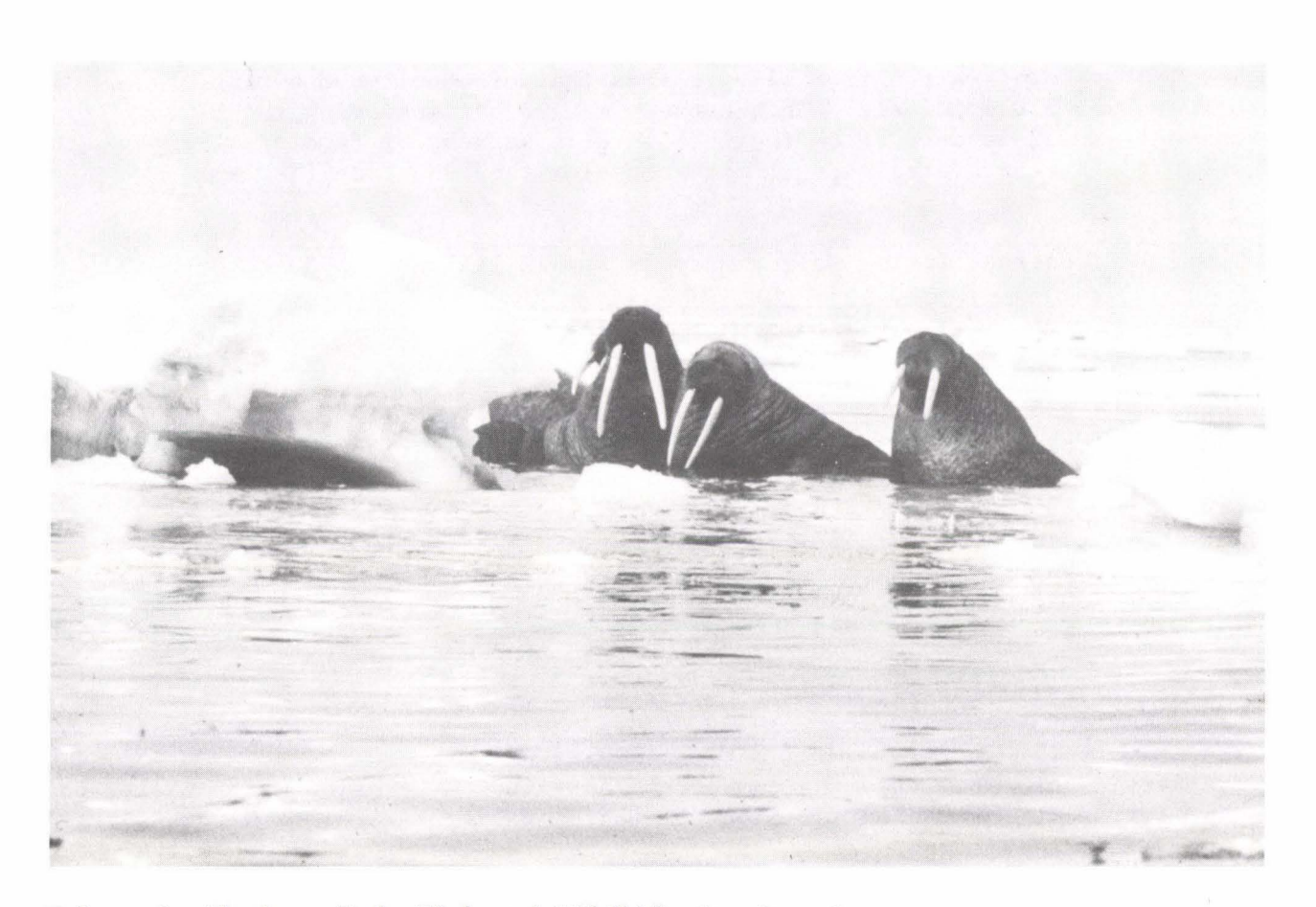
Walrus in Alaska.

Although authorized by Congress in 1981, the Service deferred action on establishing regulations for marking, tagging, and reporting (previously referred to as reporting and sealing) Native take of polar bear, walrus, and sea otter on the assumption that return of marine mammal management authority to the State of Alaska was imminent. Later, the Service developed a proposed rule for marking, tagging, and reporting Native take of polar bear, walrus, and