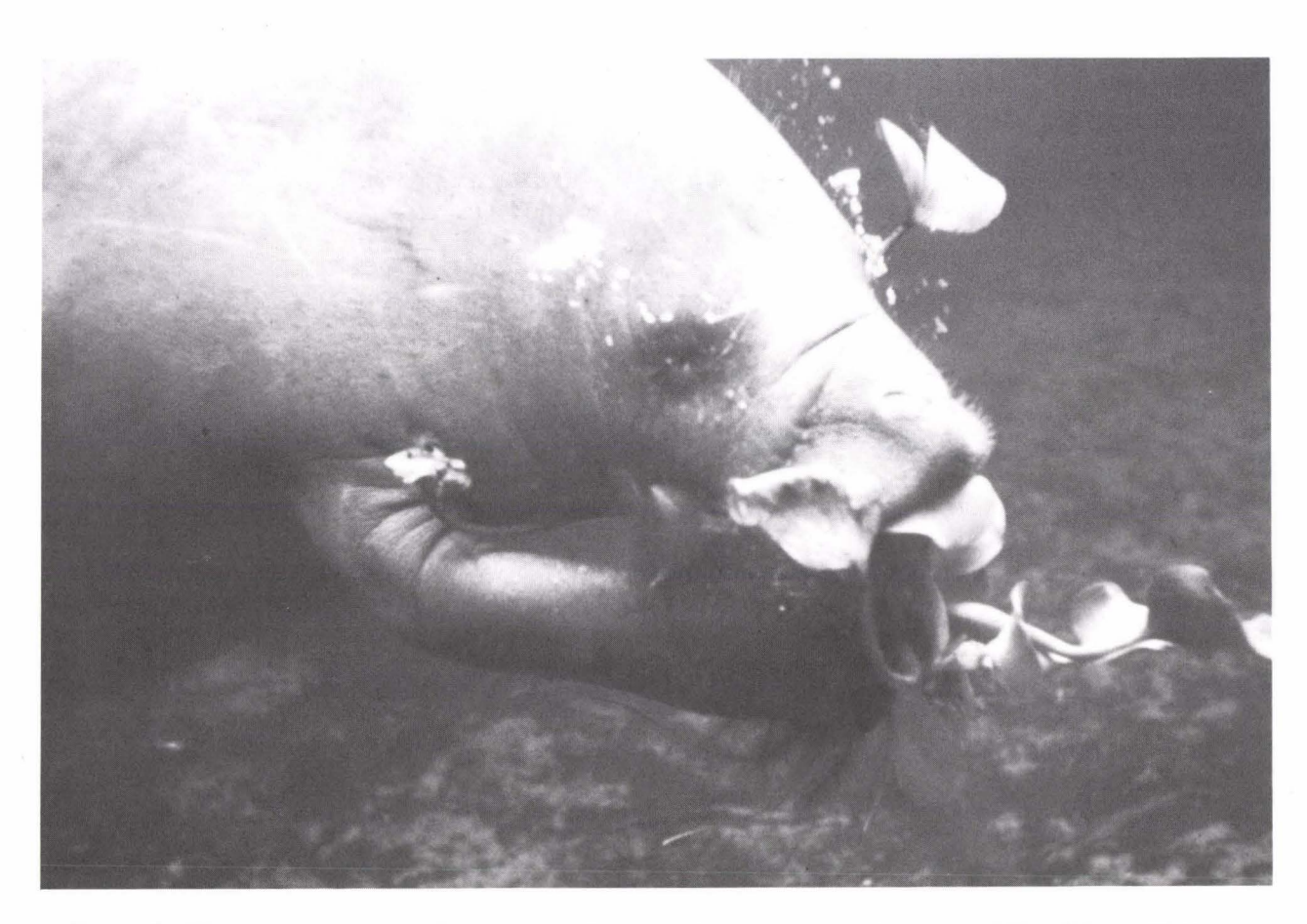
A West Indian manatee eating water hyacinth, Volusia County, Florida.

monitoring dugong movements, as there is no need for expensive air and boat time to track the animals. The basic techniques and technology associated with tracking dugongs and manatees by satellite were developed by the Service's Sirenia Project in Gainesville, Florida. The Service will continue to collaborate with the Australians in using radio-tracking techniques to study dugong movements in Queensland.