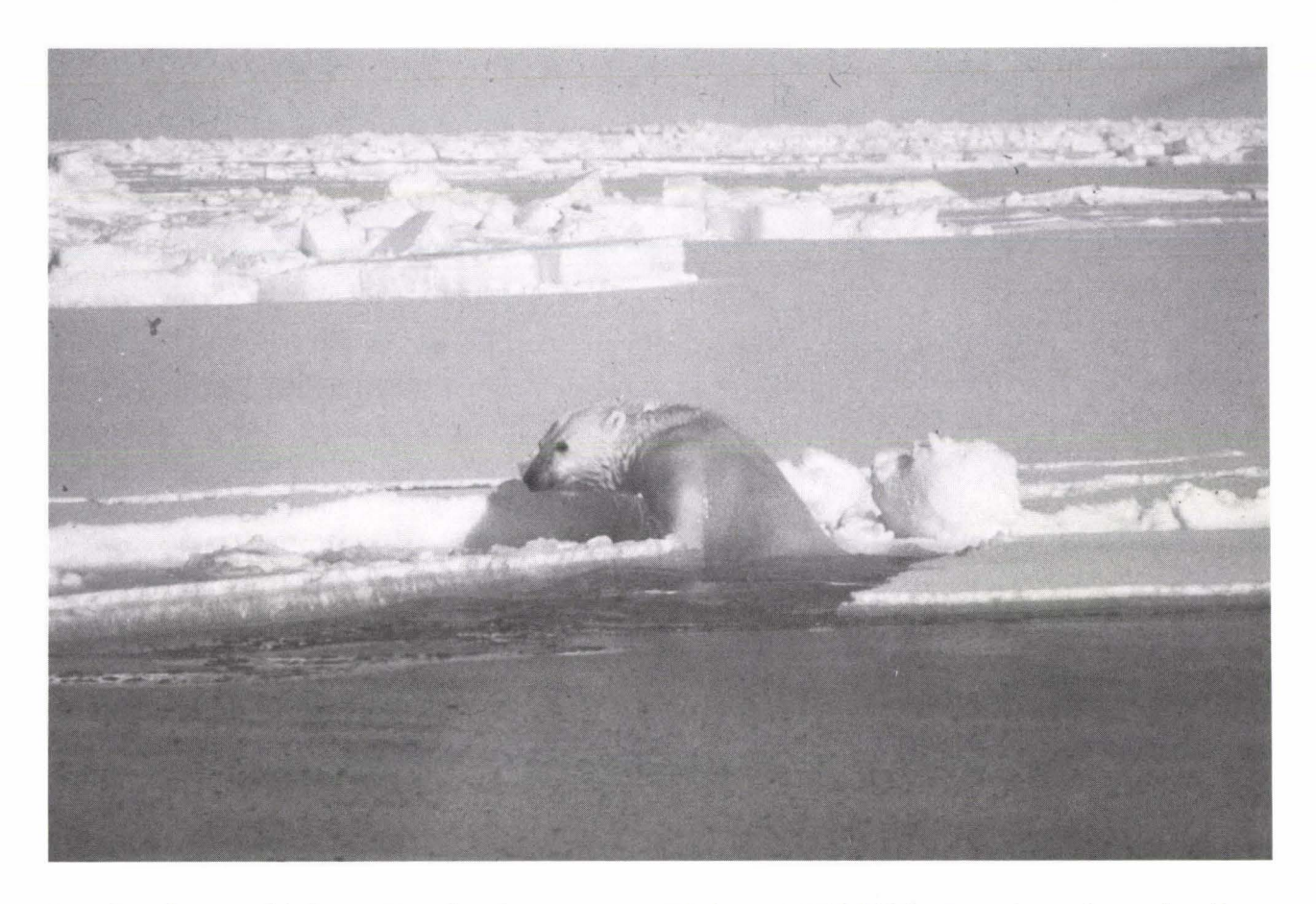
A polar bear climbs onto the ice.

The Service provided technical assistance to the North Slope Borough Fish and Game Committee and Inuvialuit Game Council in their development of a Polar Bear Management Agreement. This Agreement was signed in January 1988 and focuses on cooperation in managing and maintaining a viable polar bear population that is shared between the Inuvialuit (Northwest Territory, Canada) and Inupiat (northern Alaska) peoples. The major objectives of the Agreement are to: (1) protect female polar bears; (2) minimize effects of human activities; (3) manage bears on a sustained yield basis; (4) promote research; and (5) encourage the wise use of bear products and by-products.