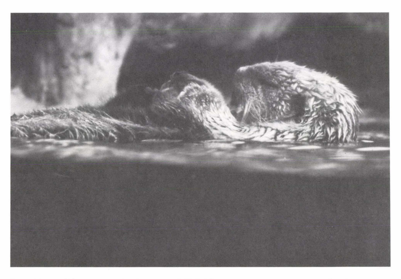
Sea otter with pup.

The third verification occurred December 8, 1987. On that date a fisherman reported two otters in a kelp bed just near the Los Angeles/Ventura County line. Biologists from the Ventura Office verified three adult otters and one pup. All adult otters had been translocated to San Nicolas Island and had obviously swam to the mainland. Service researchers coordinated capture operations with State biologists, resulting in the capture of the female and her pup and their return to the location within the parent population where she was originally captured. A severe winter storm rapidly moved in and precluded follow-up efforts to capture the remaining two females. Searches for these otters have continued.