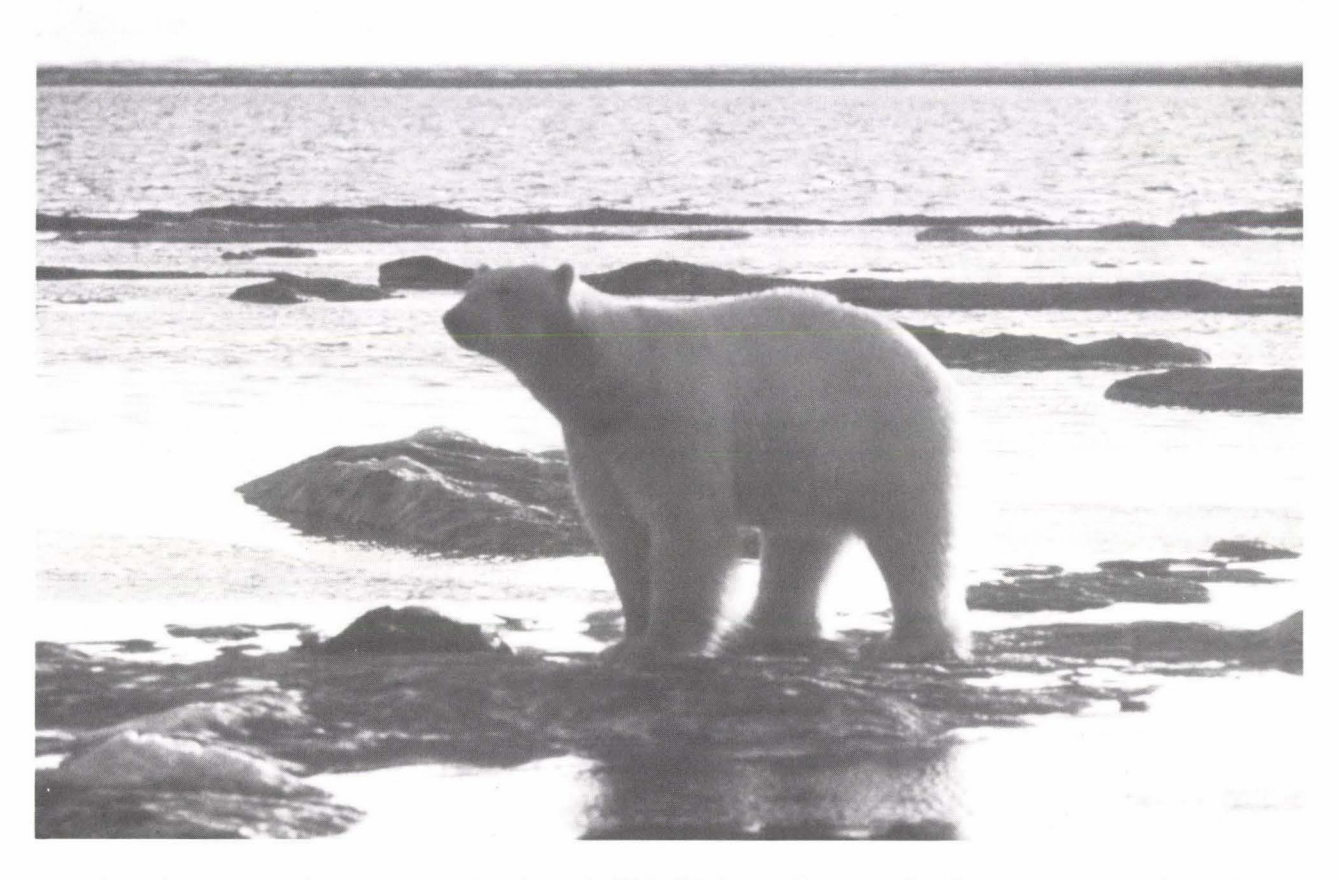
A polar bear on the Arctic National Wildlife Refuge, Alaska.

Locational data for polar bears were integrated into a Geographical Information System in FY 1987. Sources of remote-sensed ice data and other digitized ice data will be located in FY 1988 to use the Geographical Information System for assessing habitat/polar bear interrelationships.