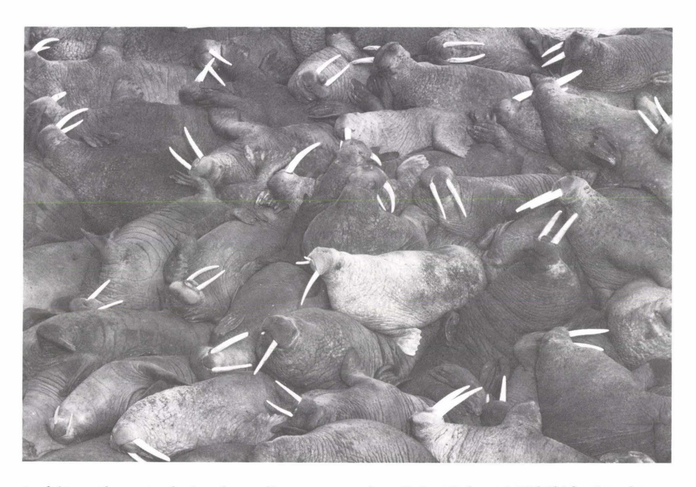
A white, three tusked walrus (lower center).

Surveys of a known population of simulated sea otters (i.e., inflated brown plastic garbage bags) were undertaken using line and strip census techniques to assess the suitability of various survey techniques and platforms. An additional repetition of the study will occur in winter