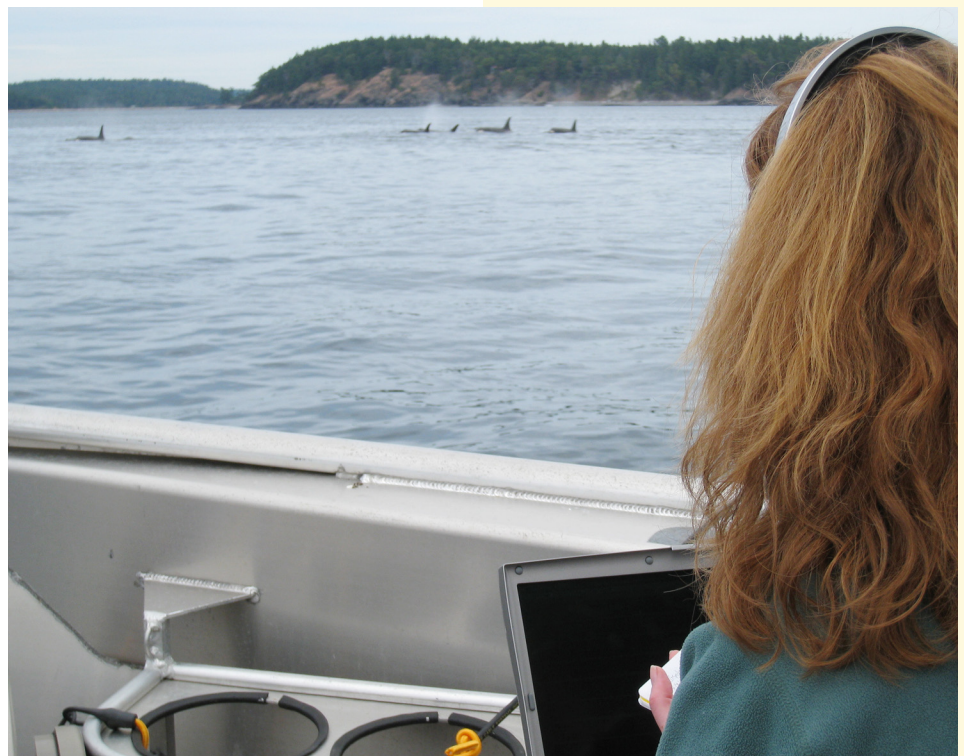
As Southern Resident killer whales pass the research vessel, scientists measure acoustic levels of their vocalizations, background noise levels, and vessel counts.