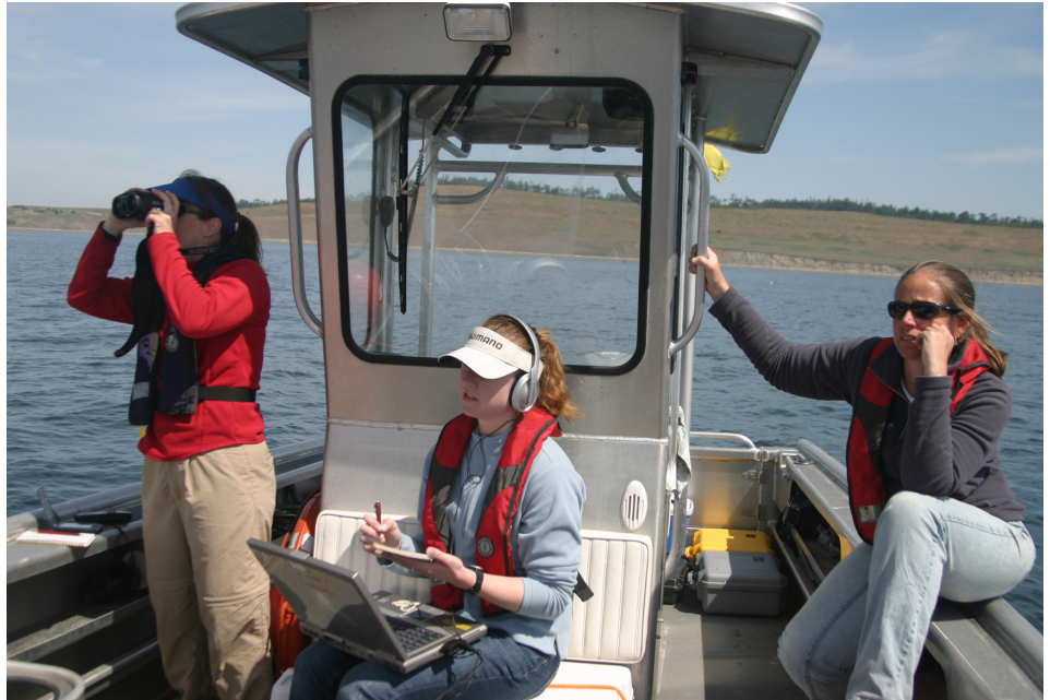
Scientists collect acoustic recordings and killer whale behavioral data in the San Juan Islands.