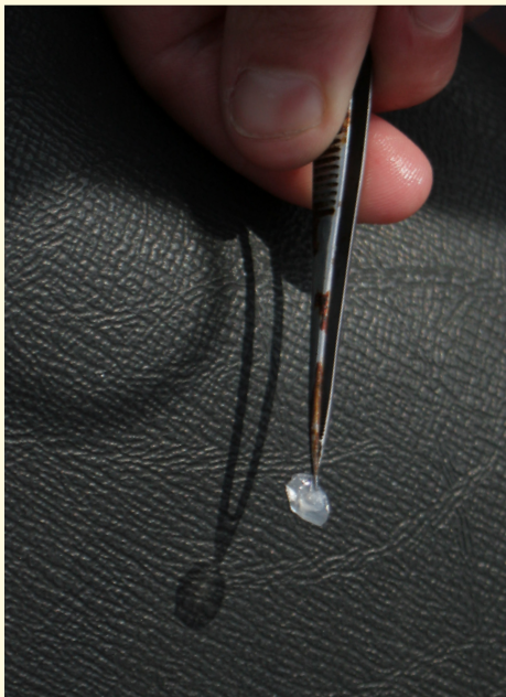
Scales collected after a prey event by a Southern Resident killer whales can be used to identify the species, age, and stock of the fish it came from.

Another study conducted by Dr. Dawn Noren used daily activity budgets to estimate the total energy expenditure and prey energy requirements of all individuals in the Southern Resident killer whale population. The results show that energy expenditure and prey consumption increases with age and body size. Not surprisingly, individual adult male killer whales require more food per day than adult females. However, since the Southern Resident killer whale population is comprised of many more adult females than adult males, this segment of the population, as a whole, consumes the majority of the total prey consumed by Southern Resident killer whales. Furthermore the number of fish consumed per killer whale varies with the size and species of the fish. For example, if Southern Resident killer whales only consume Chinook, which are large and energy-rich, they will consume fewer fish than if they only consumed chum, which are smaller and less energy-rich. These results provide one explanation of why Southern Resident killer whales seem to prefer Chinook over other salmon species.