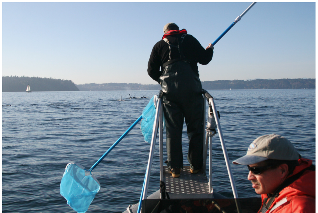
Scientists attempt to collect prey and/or fecal samples from J pod in the Puget Sound.