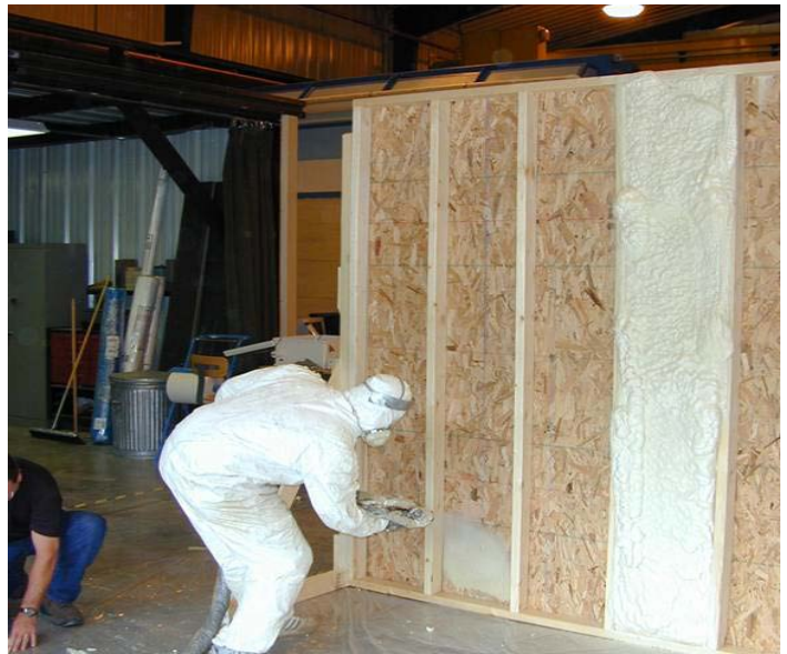
(Oak Ridge National Laboratory, http://www.ornl.gov/sci/roofs+walls/AWT/HotboxTest/WoodFrame/SoyBean/index.htm )

Before applying foam to open cavities such as basement walls with open stud bays, certain areas may need to be protected. These may include any electrical outlets, as well as nearby HVAC equipment, windows or doors, and flooring, as the foam tends to overspread and stick. When filling open cavities, you should wear protective gear such as a polyethylene suit to prevent skin exposure and a respiratory mask with an organic vapor cartridge and particulate filters.