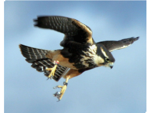
northern Aplomado falcon

Aplomado falcons are a medium-sized falcon, approximately 14 to 18 inches in length with a wingspan of 31 to 40 inches. Sexes are similar in appearance, but females tend to be larger than males.