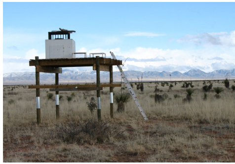
Aplomado falcon hack tower.

populations in the U.S. The intense overgrazing that resulted in shrub encroachment in Chihuahuan Desert grasslands in New Mexico and Arizona has moderated, and there has been widespread implementation of improved range management techniques. In addition, the use of DDT was banned in Mexico in 2000.