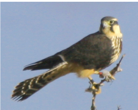
northern Aplomado falcon

The Recovery Plan recommends that an attempt should be made to establish