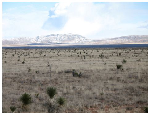
Falcon habitat, White Sands Missile Range in background.

Falcon habitat consists of open terrain with scattered trees or shrubs. In Mexico, they inhabit palm and oak savannas, open tropical deciduous woodlands, seasonally flooded coastal savannas and marshlands, desert grasslands, and upland pine parklands.