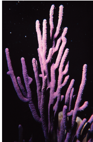
A purple soft coral.

A healthy coral reef ecosystem contains thousands of species, so you can't really include everything in your model. Instead, plan a model that is colorful and interesting, using the images on these pages for ideas. Remember, the main idea is to create a model that will help start a conversation about coral reefs (and is also good to eat!).