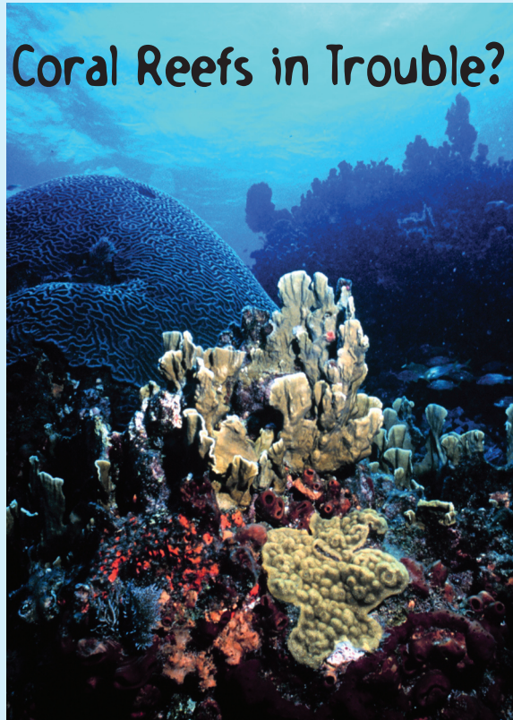
Reef scene.

Pollution – Chemical poisons from sewers, farm runoff, and many other sources kill corals and many other ocean species. Fishermen