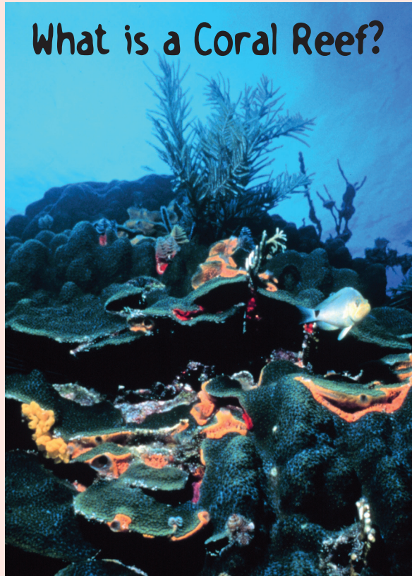
A colony of star coral.

As the polyps grow and multiply, the coral colony may become shaped like boulders, branches or flattened plates. Some corals form tall columns, others resemble mushrooms, and some simply grow as a thin layer on top of rocks or the skeletons of dead corals.