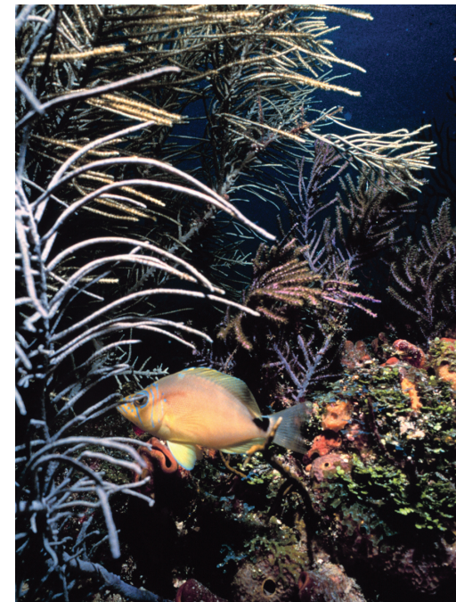
Butter hamlet fish with soft corals.