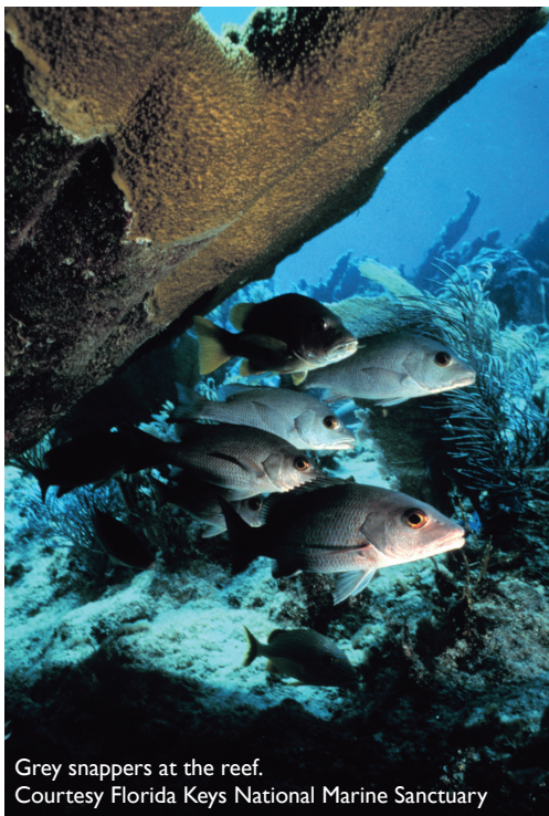
Grey snappers at the reef.

7. Show your model to your friends, parents, school, or other groups, and talk about why coral reefs are important, why they are in trouble, and what we can do to help save them. If you are using your model at school, your teacher may be able to arrange for you to make a presentation about coral reefs to another group of students, perhaps a younger class. When you have finished your presentation, you can say, "Now it is time for us to have a direct interaction with this model reef." Which means everyone can eat the cake!