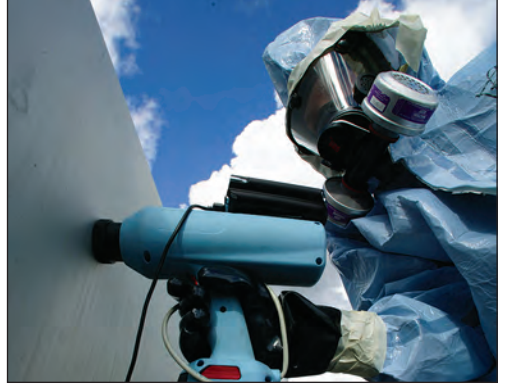
PNNL developed the Acoustic Inspection Device to help identify the contents of sealed containers. For nearly 20 years, PNNL has trained officials from around the world to use this technology and others to help detect materials or components of weapons of mass destruction being shipped across borders.

Researchers at PNNL's Radiochemical Processing Laboratory advance radiological material processes and solutions for environmental, nuclear and national security initiatives. Specialized capabilities, along with the ability to receive and prepare highly active and dispersible materials, enable research not available elsewhere.