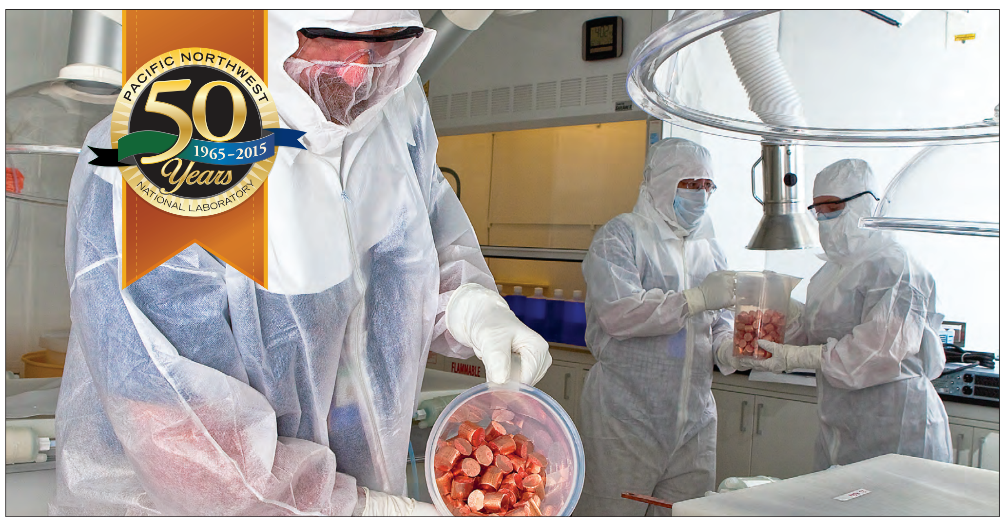
Scientists at PNNL's Shallow Underground Laboratory utilize an electroforming process to produce high purity copper used in ultra-low background detector research and development for environmental, national security and fundamental physics applications. This research supports activities including international treaty verification to prevent and counter acts of terrorism.