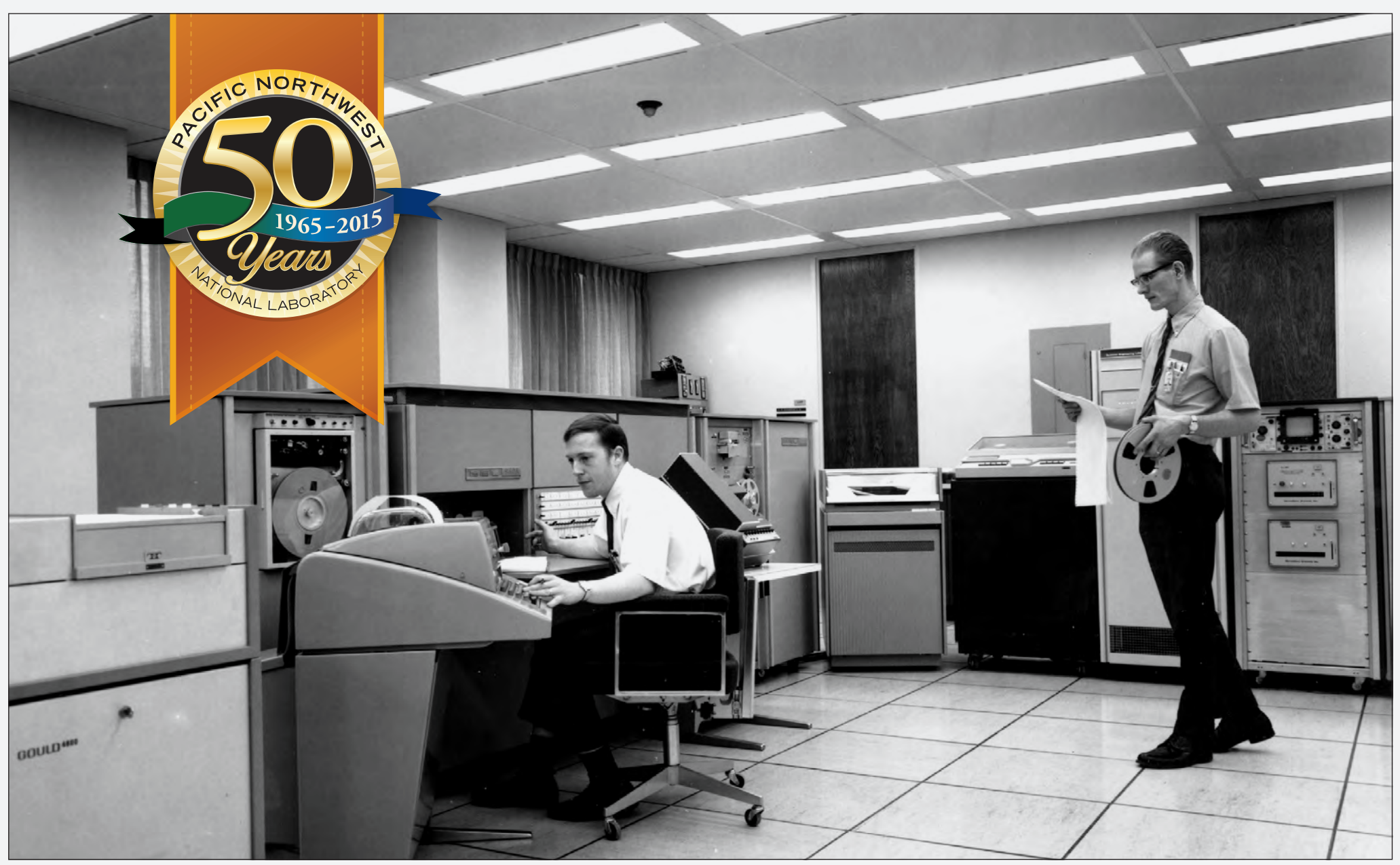
In the 1970s, Pacific Northwest National Laboratory's researchers worked in state-of-the-art computer facilities that included a digital computer system for data acquisition and process control system development. Today. PNNL is home to Constance, a fast, reliable supercomputer that is helping scientists do complex, advanced research in areas such as climate science and smart grid development.