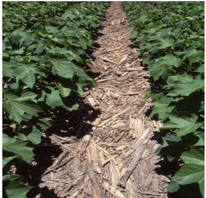
No-till cotton planted directly into corn plant residue, which helps prevent weed growth and conserves soil moisture. (ARS K7520-9)

Continuous No-till: All crops in rotation are produced with practices having STIR values <20.