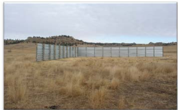
Figure 2 – Typical Wind Shelter Structure

Locate the shelter on level, uninterrupted terrain, if possible. If the shelter must be located downwind of a hill, place the shelter as far downwind as possible. A shelter upwind of a hill shall be placed a minimum of 75 times the shelter height upwind of the base of the hill.