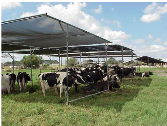
Figure 1 – Typical Shade Structure

Orientation. Orient the longest axis in a north to south direction to maximize the amount of shade and to allow sunlight to dry the area under the structure.