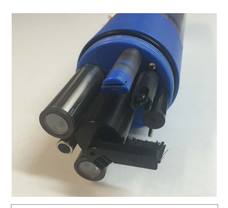
Example of water quality sensor being used in the Village Blue research project.

Over the next three years, the Village Blue project will provide important water quality information for Baltimore Harbor; support the development and test the accuracy of new low-cost water sensors; increase public awareness of water quality and ecosystem health through