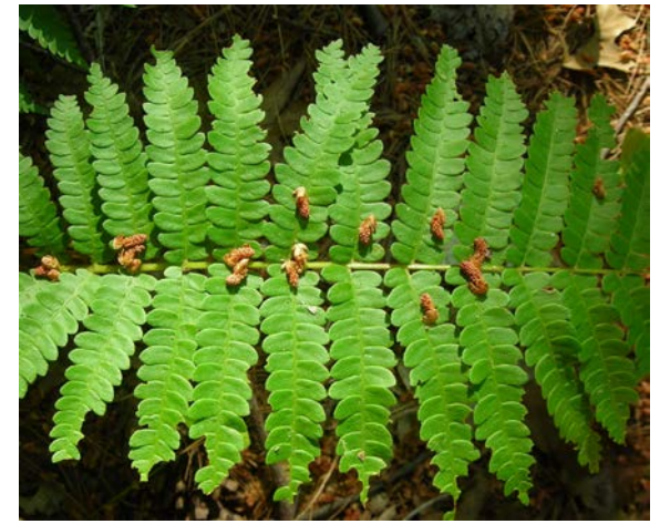
Cinnamon Fern. Great Bay Reserve in New Hampshire