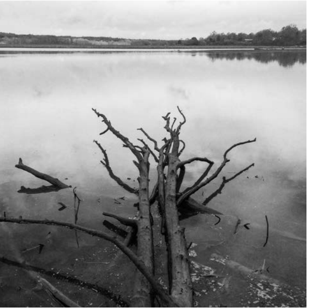
The Moody Reserve. Coreen Weilminster, Chesapeake Bay Reserve in Maryland