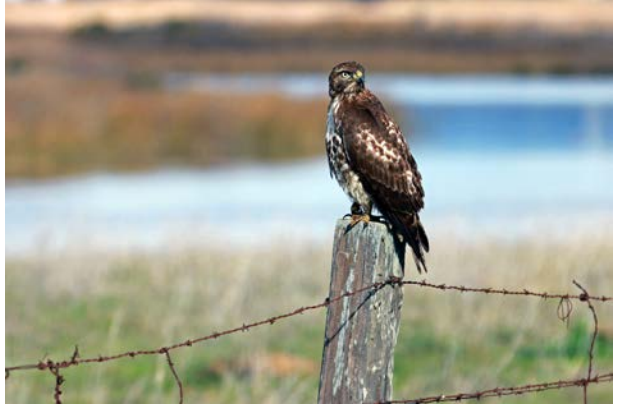
Red Tail Hawk. San Francisco Reserve in California