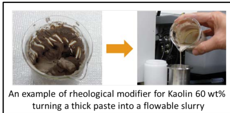
Figure 3-1. Example of Impact of Rheological Modifier.

effect would be relatively instantaneous because it does not involve any chemical reactions. Further, special thermodynamic conditions such as higher temperatures are generally not needed. Previous studies showed that weak carboxylic acids (e.g., citric acid) are promising rheological modifiers (decreasing by ~ 70 % of yield stress for the AZ-101 simulant). 56 But the performance was dependent on various physicochemical properties of particles (e.g., composition and particle size distributions) as well as types of rheological modifiers. Such details have not been completely investigated yet.