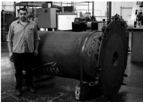
Novel inserted sleeve for hydrogenated Ti sponge produced at ADMA Products, Inc. The vessel is approximately 30 inches in diameter and can produce 800 to 1000 lbs of titanium sponge per cycle.