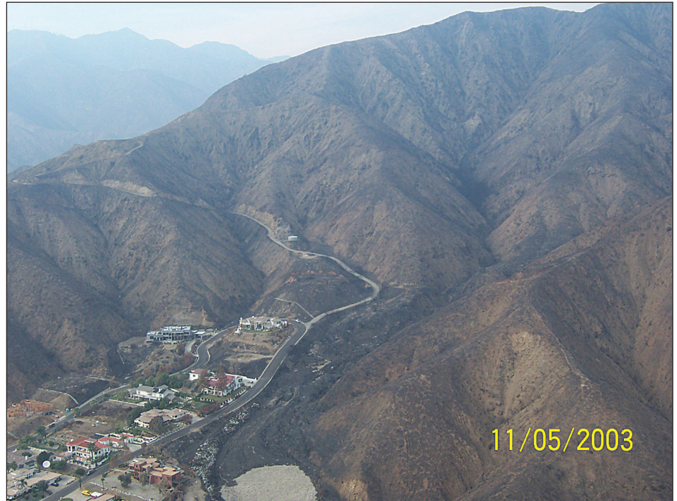
Photograph of a typical burned hillslope in southern California.

Analysis of data collected from studies of debris flows following wildfires can answer many of the questions fundamental to post-fire hazard assessments—what and why, where, when, how big, and how often?