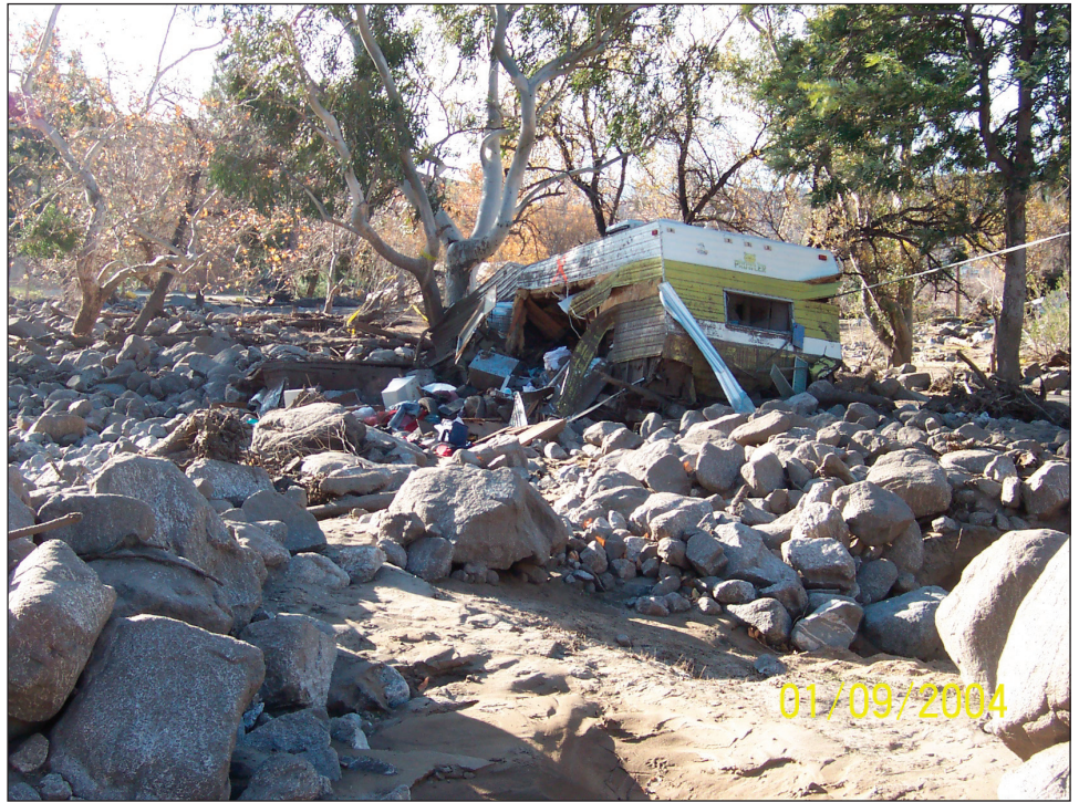
Campground in Cable Canyon, southern California, where a debris flow on December 25, 2003, killed two people. A wildfire during the previous October burned hillslopes in the area, and heavy rains triggered the deadly debris flows.

Debris-flow hazard maps: In 2003, large areas in San Bernardino, San Diego, and Ventura Counties burned; debris flows are now a hazard in these burned areas. The U.S. Geological Survey (USGS) has