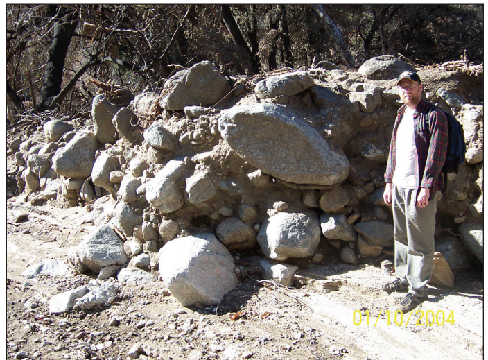
Debris-flow deposits produced during a Christmas day 2003 storm in Waterman Canyon, San Bernardino County, California.