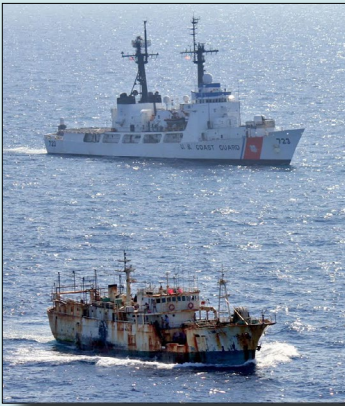
The Coast Guard Cutter Rush escorts suspected IUU vessel.