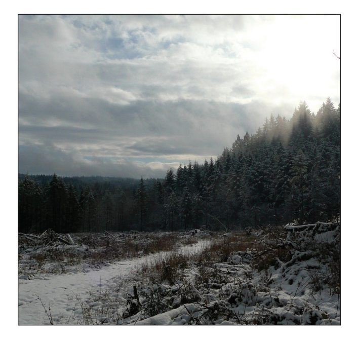
Snow covered working forest

BPA's fish and wildlife program protects and preserves valuable fish and wildlife habitat throughout the Northwest. Since its inception in 1980, the program has set aside more than 300,000 acres of land benefiting hundreds of species. The program protects habitat from development either through outright purchase of land or by purchasing conservation easements on privately owned property. BPA works in partnership with conservation groups, local tribes and state fish and wildlife management agencies.