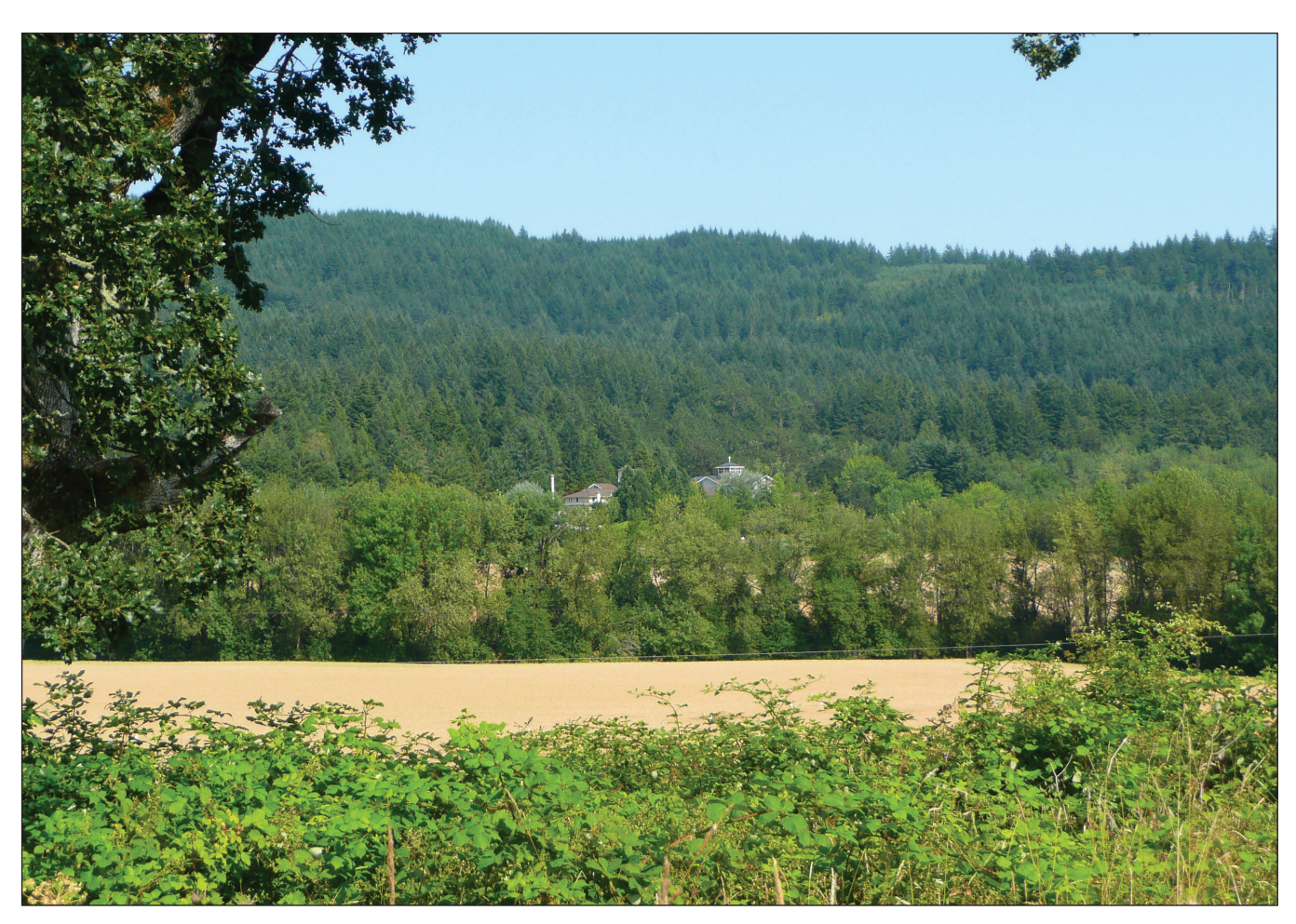
Complimentary land uses. Our Lady of Guadalupe Trappist Abbey Monastery among the living and working landscape