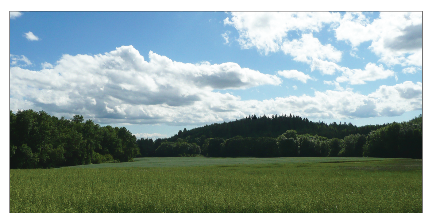
Sustainable forest production, agriculture and healthy wildlife habitat in the Willamette Valley.

This property is located in a high-priority conservation area as identified in the Oregon Wildlife Conservation Strategy adopted by the Oregon Department of Fish and Wildlife. The types of habitat on the property include native conifer woodlands, upland prairie, oak savanna, oak woodlands, grasslands and wet