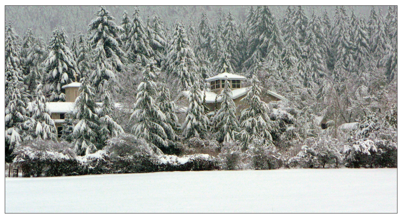
Our Lady of Guadalupe Trappist Abbey Monastery

prairies. This habitat supports many species of plants and wildlife including several migratory and resident birds such as the acorn woodpecker, streaked-horned lark and white-breasted nuthatch.