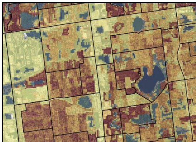
Figure 1: A dasymetric population map for several census blocks in Tampa Bay, FL. A single census block may have pixels that are non-habitable, as indicated in blue, as well as a range of low, medium, and high-density land cover types indicated in shades of red—the darker the pixel, the greater the population density.

Dasymetric mapping is a geospatial technique to more accurately distribute data that has been assigned to arbitrary boundaries, such as census blocks, using additional