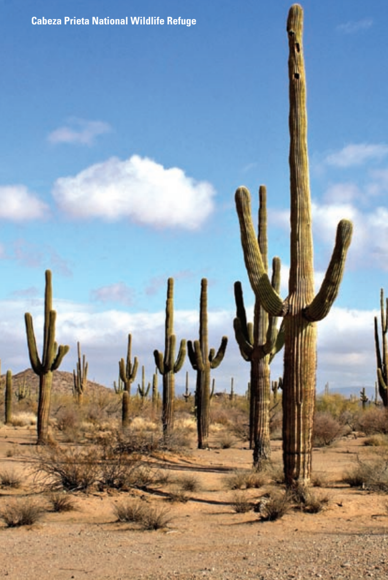
Cabeza Prieta National Wildlife Refuge