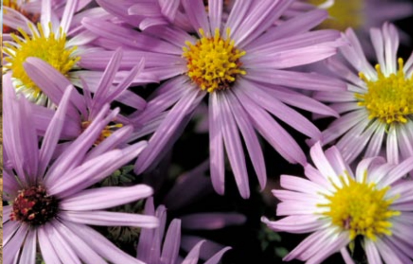
J.N. "Ding" Darling National Wildlife Refuge