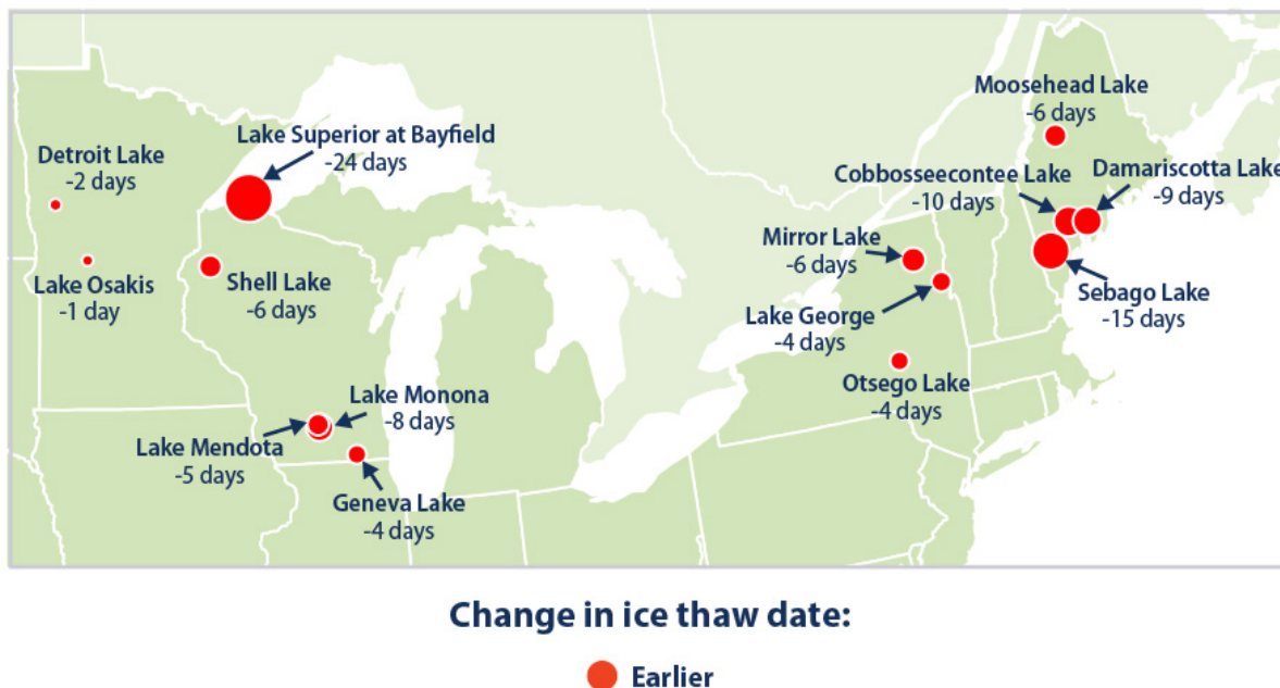
Figure 3. Change in Ice Thaw Dates for Selected U.S. Lakes, 1905–2015

This figure shows the change in the “ice-off” date, or date of ice thawing and breakup, for 14 U.S. lakes during the period from 1905 to 2015. All of the lakes have red circles with negative numbers, which represent earlier thaw dates. Larger circles indicate larger changes.