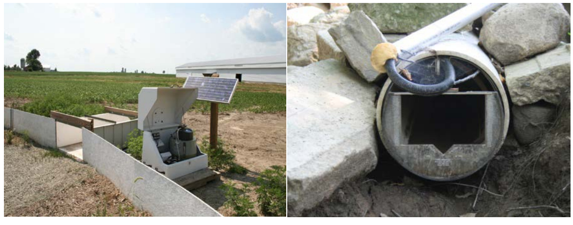
Figure 1: Edge-of-field surface runoff site with a 2.5 foot H-flume

<sup>d</sup> Optional feature valuable for monitoring flow conditions and confirming event occurrence at remote sites. <sup>c</sup> Enclosure such as a calf hut with a propane heater will likely be necessary for year round sampling in northern sites.