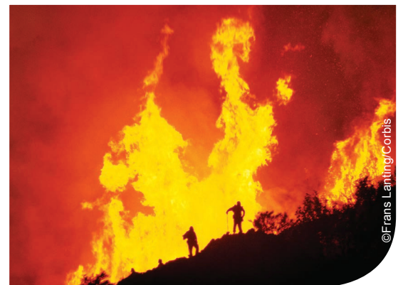
Climate change contributes to increasing fires.

More than half of the nation's high-value specialty crops, including certain fruits, nuts, and vegetables, come from the Southwest. A longer frost-free season, less frequent cold air outbreaks, and more frequent heat