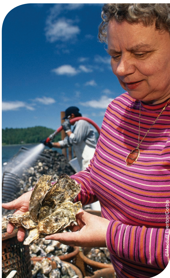
Oyster harvest in Coos Bay, Oregon. Ocean acidification poses threats to the region's important shellfish industry.

Climate change will alter Northwest forests by increasing wildfire risk, insect and disease outbreaks, and by forcing longer-term shifts in forest types and species. Many impacts will be driven by water deficits, which increase tree stress and mortality, tree vulnerability to insects, and fuel flammability. By the 2080s, the median annual area burned in the Northwest would quadruple relative to the 1916-2007 period to 2 million acres (range 0.2 to 9.8 million acres) under a scenario that assumes continued increases in emissions through mid century and gradual declines thereafter (A1B). 11