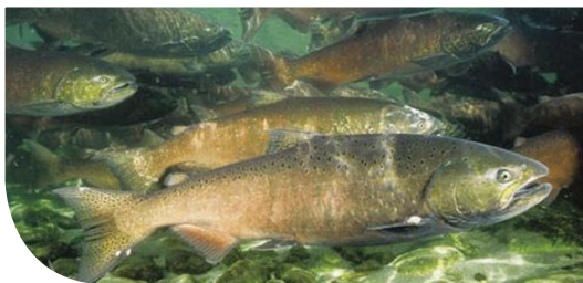
Rising summer temperatures and changing water flows threaten salmon and other fish species.

While the agriculture sector's technical ability to adapt to changing conditions can offset some adverse impacts of a changing climate, there remain critical concerns for agriculture with respect to costs of adaptation, development of more climate resilient technologies and management, and availability and timing of water.