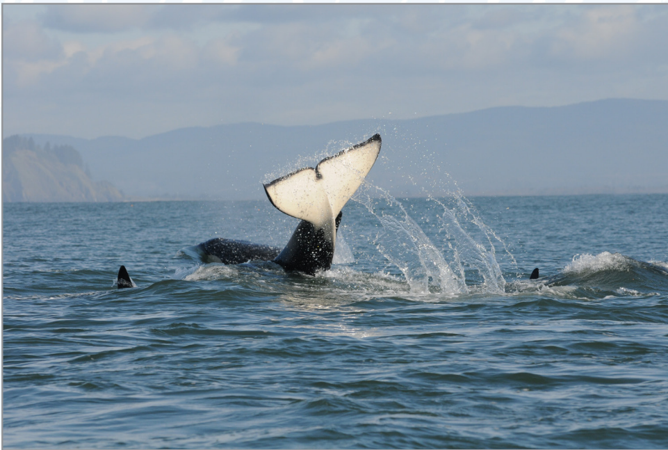
Photographed during Winter 2015 killer whale research survey to better understand different sources of salmon prey.

NOAA Fisheries also consults under Section 7 of the ESA with other federal agencies on issues such as operations of dams, recommending changes to make them safer for fish. These improvements are now well underway throughout the Columbia River Basin, which is home to one of the largest endangered species recovery programs in the country.