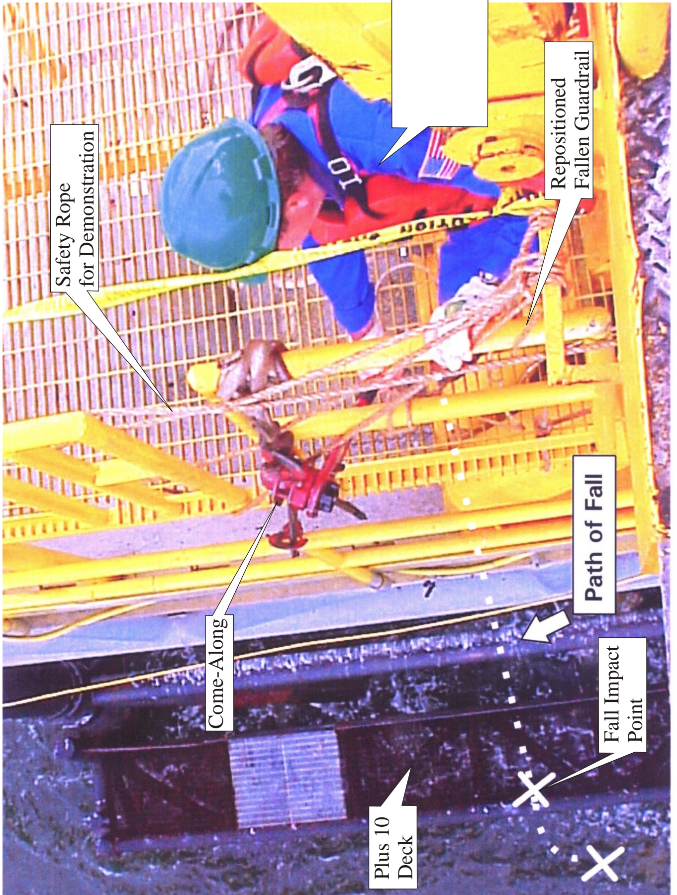
Photograph Demonstrating Fall