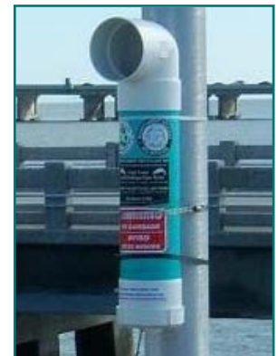
Monofilament Fishing Line Recycling Bin