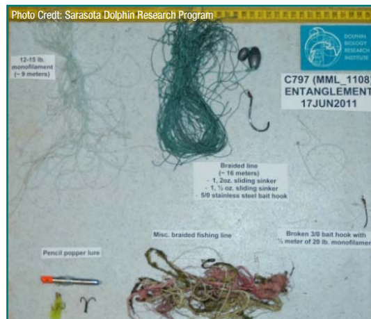
All fishing gear removed from a dolphin calf during a rescue event in Sarasota, FL.