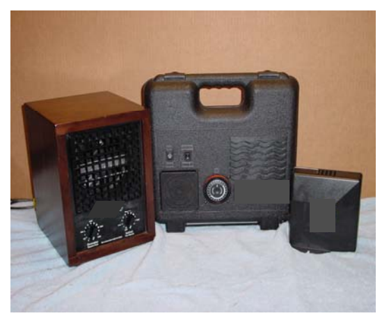
Common ozone generators

Some indoor "air purifiers" or air cleaners emit ozone, a major component of outdoor smog, either intentionally or as a by-product of their design. Those that intentionally emit ozone are often called "ozone generators," and are the focus of this fact sheet. Manufacturers sometimes inappropriately refer to ozone as "activated oxygen," "super oxygenated" or "energized oxygen," implying that ozone is a healthy kind of oxygen. Because ozone reacts with some other molecules, manufacturers claim that the ozone produced by these devices can purify the air and remove airborne particles, chemicals, mold, viruses, bacteria, and odors. However, ozone is not effective at cleaning the air except at extremely high, unsafe ozone levels, and then it is only partially effective.