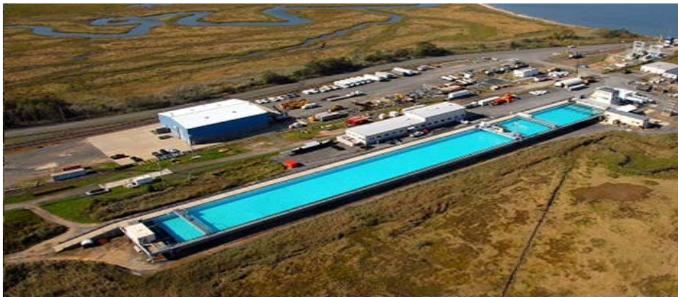
Figure 2: Ohmsett Facility in New Jersey

The Ohmsett facility requires constant maintenance and periodic upgrades. During FY 2015, the Ohmsett facility completed a scheduled five-year test tank renovation as well as the construction of a new warehouse to replace the one destroyed during Hurricane Sandy. Mitigation efforts to harden and protect Ohmsett assets from future extreme weather events were completed concurrently. Information on Ohmsett can be found at www.ohmsett.com .