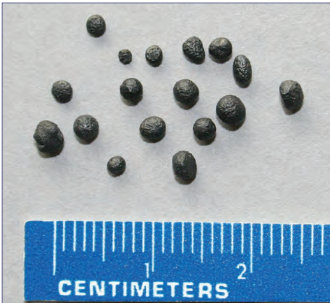
Lead shotgun pellets, showing various amounts of erosion, from the gizzard of a lead poisoned trumpeter swan (J. C. Franson, USGS).

Lead shotgun pellets settle to the bottom of lakes and ponds and may be mistaken for the grit that waterfowl consume to aid in grinding food. Regulations restricting the use of lead ammunition have been instituted in at least 29 countries. Before the 1991 nationwide ban on the use of lead shot for waterfowl hunting in the United States, an early study estimated that up to 3 percent of all waterfowl in North America died annually from lead poisoning. Birds of prey and other predators were also poisoned as they fed on waterfowl that were sick from ingesting lead shot, dead, or crippled by lead shot embedded in their tissues. The ban was instituted to protect waterfowl as well as their predators, such as eagles. Many types of nontoxic shot are available to waterfowl hunters in the United States.