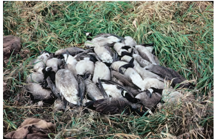
Lead poisoned Canada geese.

Visit the Fish and Wildlife Service webpage for a complete listing of approved nontoxic shot for waterfowl and American coot hunting at http://www.fws.gov/migratorybirds/CurrentBirdIssues/nontoxic.htm