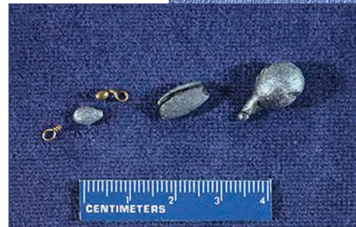
Various fishing tackle found in the digestive tracts of waterbirds.

Find a list of nonlead fishing tackle by the Minnesota Pollution Control Agency at http://www.pca.state.mn.us/oea/publications/sinkers.pdf