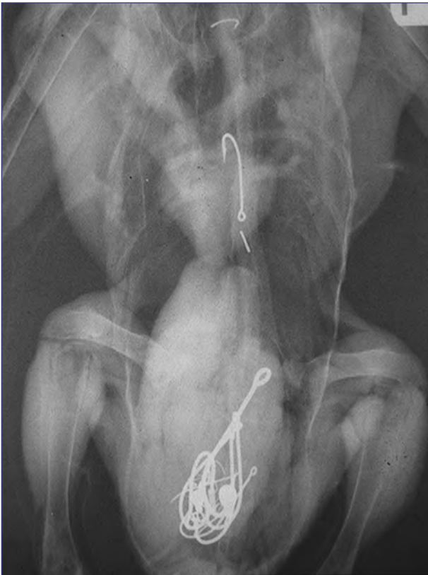
Radiograph of brown pelican with ingested fishing tackle including hooks and lead sinkers (Wildlife Care Center, Florida).

Species reported to have been poisoned by ingested lead fishing weights include trumpeter swans, brown pelicans, common loons, and other waterbirds. These birds may ingest sinkers attached to broken fishing line in hooked fish or may pick them up as grit. The use or sale of lead fishing tackle is restricted in national parks and wildlife areas in Canada. Restrictions also have been implemented in Maine, New Hampshire, New York, and Vermont, and in several United States National Wildlife Refuges and National Parks.