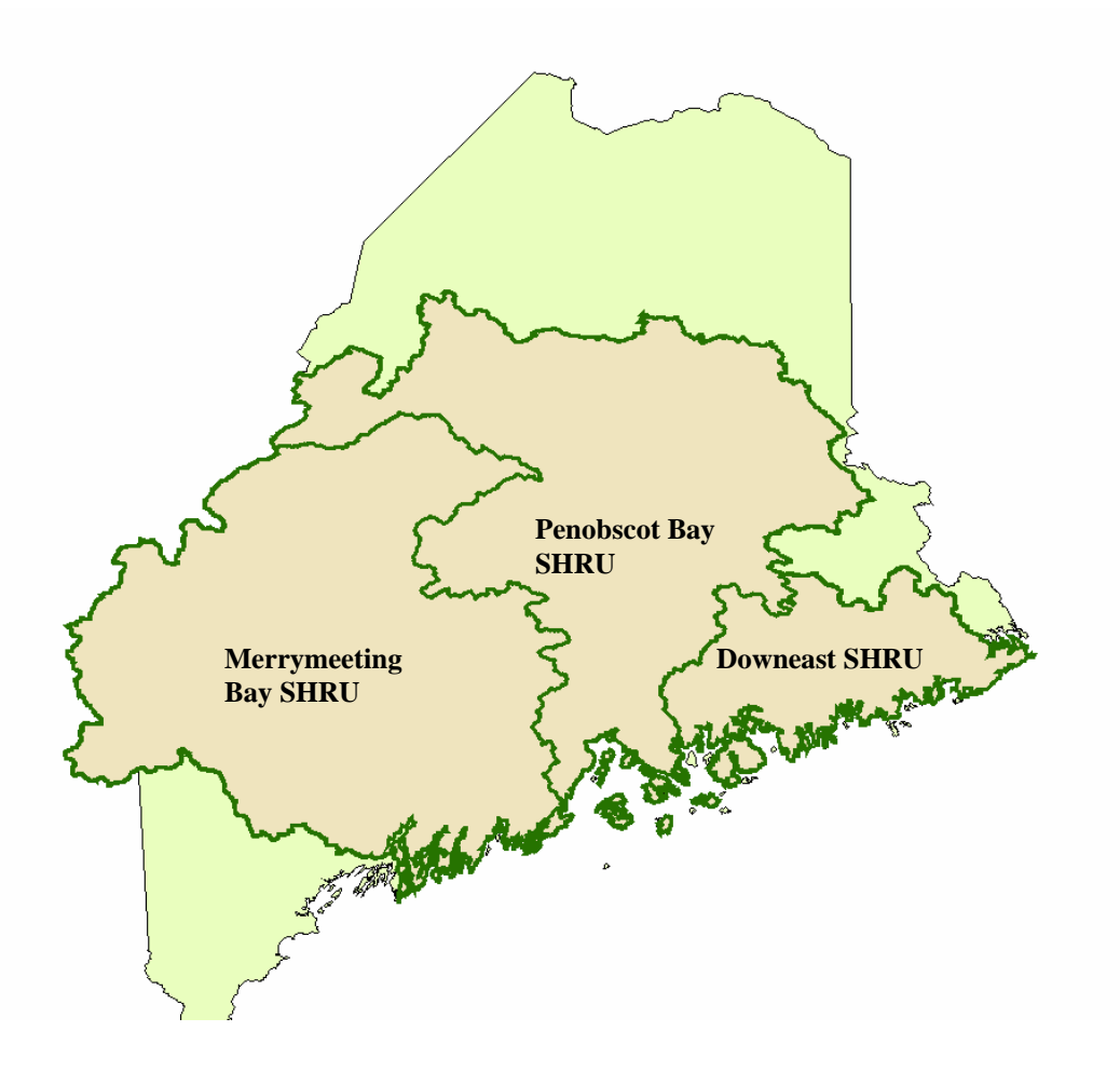
Figure 1: GOM DPS representing three SHRU's

Dividing the GOM DPS into subsets represented as SHRU's provides the best management tool for establishing recovery goals in which the species is well represented over its entire range. The SHRU delineation fits well as either management units or recovery units as described above. However, Recovery Units are more appropriate given that maintaining a population in all three SHRU's is necessary in order to preserve the genetic variability of the DPS, which in turn is necessary in ensuring that the population is capable of adapting to and surviving natural environmental and demographic variation that all populations are subjected to over time. The independent population concept does not apply to the DPS as described by McElhany et al. (2000). Even though the recovery unit delineation may represent the historic independent populations at one time, we do not have substantial data to make this determination or to predict what the independent population structure may be in a recovered population such that an independent population has a negligible extinction risk from an exchange of individuals over a one hundred year period.