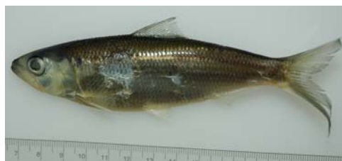
Alabama shad, Alosa alabamae .

Fact sheets are available for download on the program's website (see pg. 4).