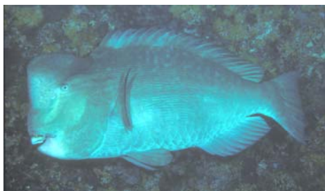
Bumphead parrotfish, Bolbometopon muricatum.

Staff provided training to Regional Fishery Management Council members on the Species of Concern program and SOC