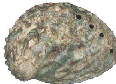
Pinto abalone, Haliotis kamtschatkana.

Northeast Region and Headquarters staff continued to participate in the Gulf of Maine Species of Concern Technical Advisory Committee for conservation of rainbow smelt and Atlantic sturgeon.