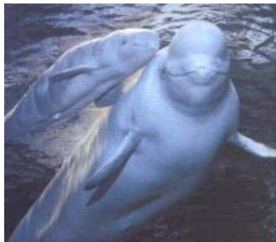
Beluga whale, Delphinapterus leucas .

There were no changes to the Species of Concern list in Fiscal Year 2008; there continue to be 42 Species of Concern. However, some species may be removed in Fiscal Year 2009. The Cook Inlet Beluga whale (ESA listed October 2008), black abalone, and Atlantic salmon were all proposed for listing as endangered and final rules are expected in 2009. A status review was completed for Atlantic sturgeon, and reviews are being conducted for cusk and Atlantic wolfish. White marlin were removed from the program in November 2008.