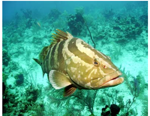
Nassau grouper, Epinephelus striatus . Courtesy