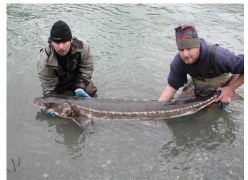
Green sturgeon, Acipenser medirostris.