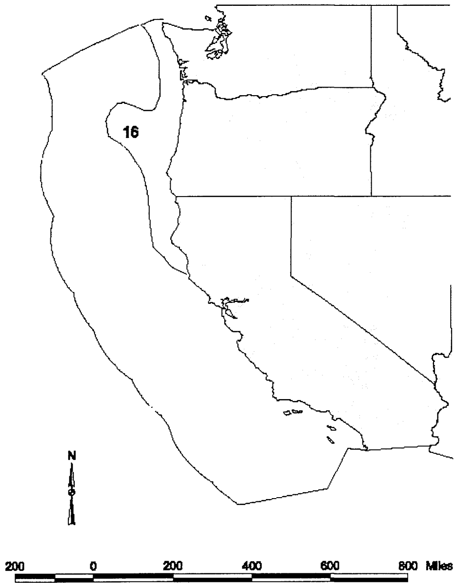
Figure 2-4. August sea surface temperatures (warmest three summers).