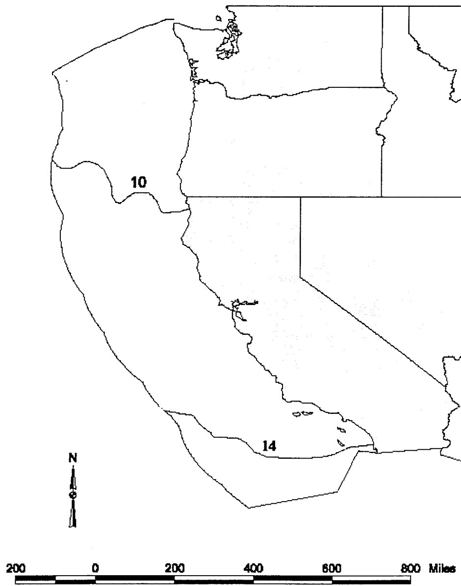
Figure 2-1. February sea surface temperatures (coldest three winters).