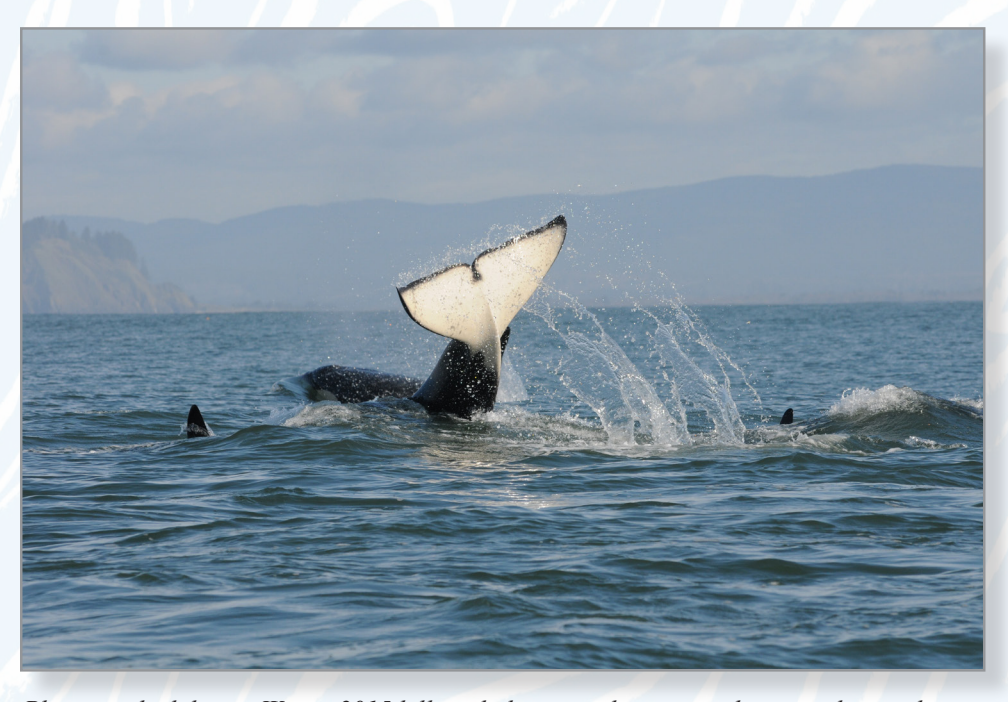
Photographed during Winter 2015 killer whale research survey to better understand different sources of salmon prey.

NOAA Fisheries also consults under Section 7 of the ESA with other federal agencies on issues such as operations of dams, recommending changes to make them safer for fish. These improvements are now well underway throughout the Columbia River Basin, which is home to one of the largest endangered species recovery programs in the country.