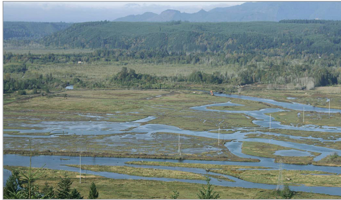
Photo left: Skokomish Estuary after restoration Photo below: Aerial image of Skokomish Estuary restoration.

PCSRF's role in restoring the region's salmon runs to healthy, viable levels is critical but just as important is the program's role in supporting the economies of local communities, like those in Mason County.