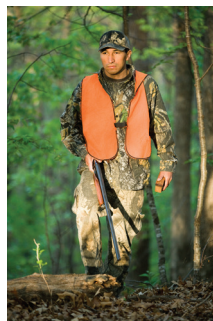
Missouri Department of Conservation©