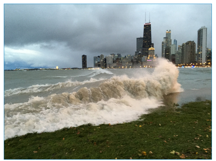
The combined effects of a storm and the recent rapid return of water levels to above-average can provide challenging conditions for shoreline residents (Credit: Lisa S. Gerstner).

Since September 2014, all of the Great Lakes have been above their monthly average levels for the first time since the late 1990s. The unusually wet conditions of 2013 and 2014 effectively ended the 15-year period of persistent below-average water levels on Lakes Superior, Michigan, and Huron. The surprisingly swift rebound in water levels on the upper lakes broke records across the region. The net rise in water levels on Lake Superior from January 2013 through December 2014 was roughly 2 feet (about 0.6 meters), the highest net increase ever recorded for a 2-year period starting in January and ending the following December. Similarly, on Lake Michigan-Huron, the rise in water levels from the record-low in January 2013 through December 2014 was a remarkable 3.1 feet (nearly 1 meter), an increase that almost tied the record rise set in 1950-1951.